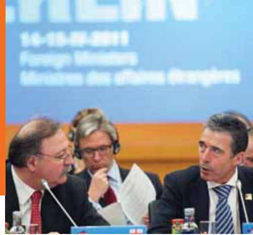
Meeting of NATO-Georgia Commission

General. All NRC countries participate as equals and decisions are taken by consensus. The NRC has proved to be a valuable instrument for building practical cooperation and for political dialogue.