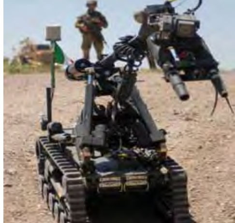
Robot against improvised explosive devices, Herat, Afghanistan