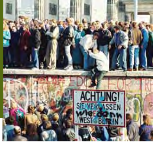
Fall of Berlin Wall – 9 November 1989