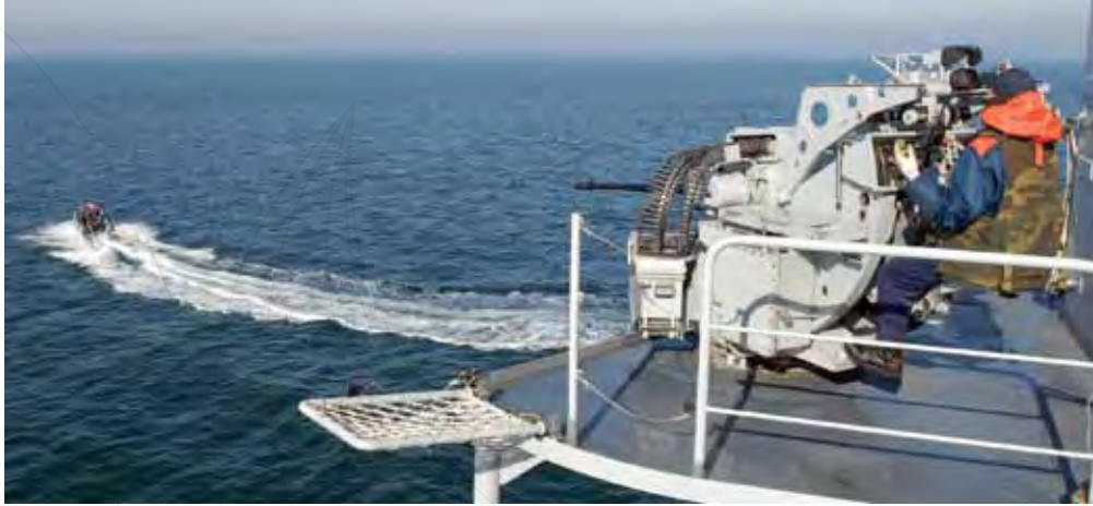
Patrolling the Mediterranean

from suspicious vessels that warranted closer inspection. If weapons, related materials or mercenaries were found, the vessel and its crew could be denied the right to continue to their destination.