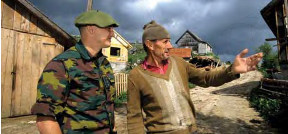
A Belgian SFOR soldier talks to a local man, while on patrol in Bosnia and Herzegovina

IFOR was succeeded by the Stabilization Force (SFOR), in December 1996. Forty-three different countries from NATO and around the world, including Russia, contributed to this force. Thanks in part to SFOR's presence, one million wartime refugees returned to their homes. Improvements in the security situation led to gradual reductions in troop numbers from the original 60,000 to 7,000.