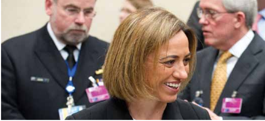
Carme Chacón Piqueras (Minister of Defence, Spain) with General David Petraeus (then Commander of ISAF) at meeting of NATO Defence Ministers, Brussels, 2011

decision-making process and NATO's military structure.