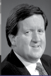
The Rt. Hon. Lord Robertson of Port Ellen 1999-2003