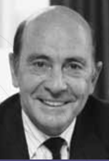
Manfred Wörner 1988-1994