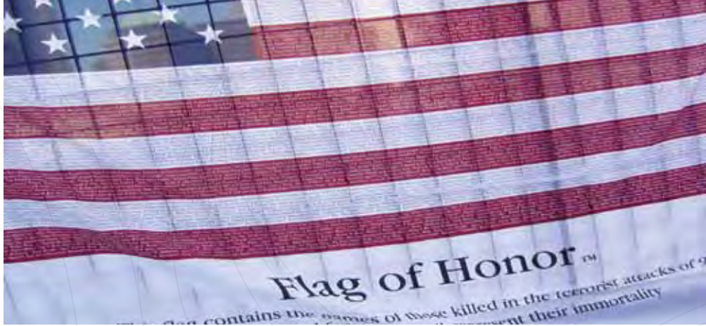
Flag of Honor in memory of victims of 9/11 terrorist attacks

soon became engaged in crisis management as well as partnership with a diverse set of countries and organizations cooperating in the wider field of security.