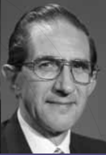
Willy Claes 1994-1995