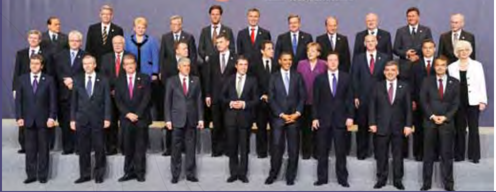
Family portrait – NATO Lisbon Summit 2010