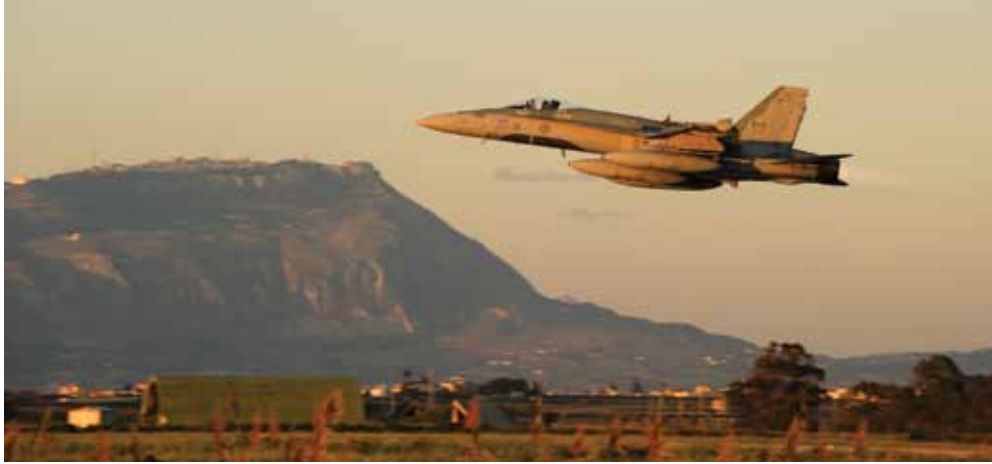
Canadian fighter during NATO Libya campaign

mission to disarm ethnic Albanians on a voluntary basis. These initiatives helped lay the groundwork for reconciliation and reconstruction in the country.