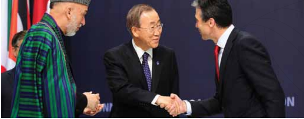
Signature of a "Declaration on Enduring Partnership" by Hamid Karzai, the President of Afghanistan, and Anders Fogh Rasmussen, NATO Secretary General, in the presence of Ban Ki-moon, UN Secretary-General

share a commitment to maintaining international peace and security. Over the years, cooperation has broadened to include consultations on issues such as crisis management, terrorism, civil-military cooperation, de-mining, civil emergency planning, human trafficking and the role of women in peace and security. In September 2008, the UN and NATO established a framework for expanded consultation and cooperation to help both organizations address threats and challenges more effectively.