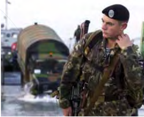
Ukrainian soldier participating in NATO exercise