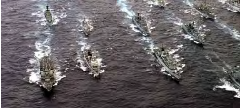
Vessels of Operation Active Endeavour

accelerate NATO's transformation into a dynamic Alliance capable of mounting operations outside NATO's traditional area of operations.