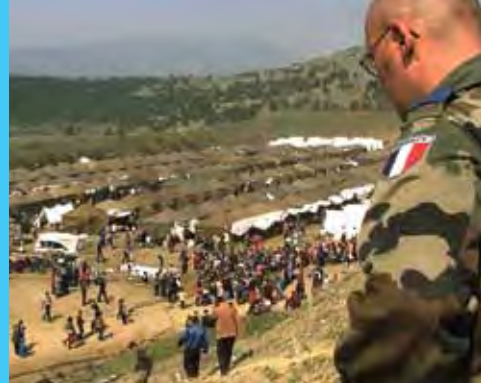
Refugees from Kosovo at NATO camp in the former Yugoslav Republic of Macedonia*

The air campaign was to last 78 days and resulted in an end to all military action by the parties to the conflict; the withdrawal from Kosovo of the Yugoslav Army, Serbian police and paramilitary forces; agreement on the stationing in Kosovo of an international military presence; agreement on the unconditional and safe return of refugees and displaced persons; and assurance of a willingness on all sides to work towards a political agreement for Kosovo.