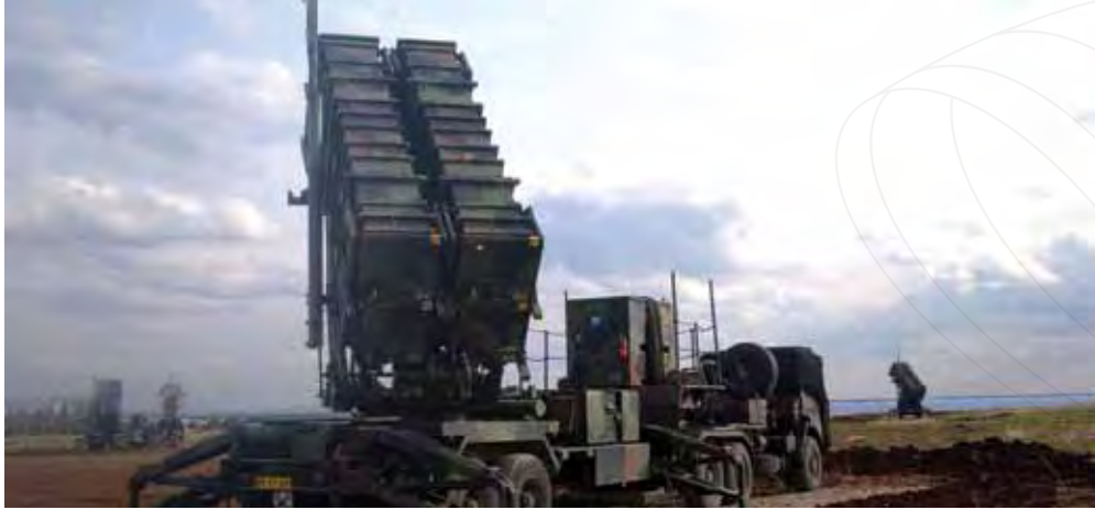
Patriot Missile Launcher

Ballistic Missile Defence (ALTBMD). When completed, the ALTBMD system will protect NATO forces against short- and medium-range ballistic missiles.