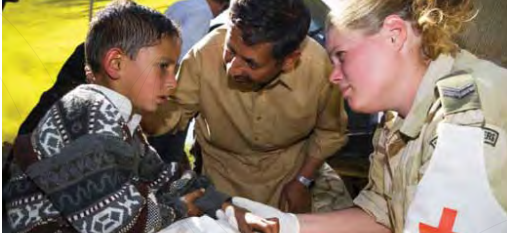
Pakistan, a Dutch nurse reassures a little boy, victim of the earthquake

this mission on 31 December 2007. When this mission became a UN-AU hybrid mission in January 2008, NATO expressed its readiness to consider any additional requests for support.