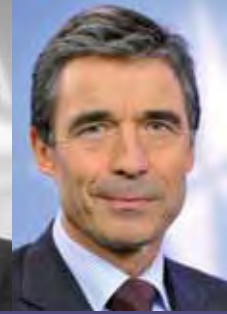
Anders Fogh Rasmussen 2009-

Political aspects of these decisions are implemented through NATO's civilian Headquarters in Brussels, Belgium. Military aspects are implemented, under the political oversight of the Council, through NATO's Military Committee. This Committee liaises with NATO's two strategic commands: Allied Command Operations located in Supreme Headquarters Allied Powers Europe (SHAPE) near Mons, Belgium, and Allied Command Transformation, located in Norfolk, Virginia, in the United States.