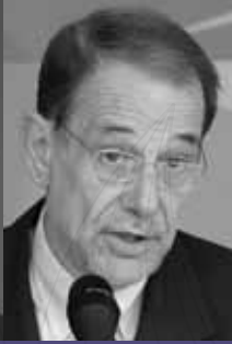
Javier Solana 1995-1999