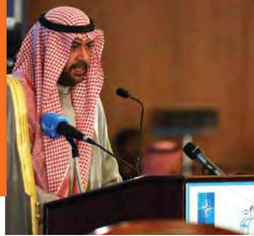
Sheik Al-Ahmad Al-Sabah of the National Security Bureau of Kuwait during "NATO and Gulf countries conference", Kuwait, 2006

1990s, intensified after the "Rose Revolution" in 2003, with support for Georgia's domestic reform process as an important priority. In 2006, an Intensified Dialogue was launched on the country's membership aspirations. At the Bucharest Summit in April 2008, Allied leaders agreed that both Georgia and Ukraine would one day become members of the Alliance.