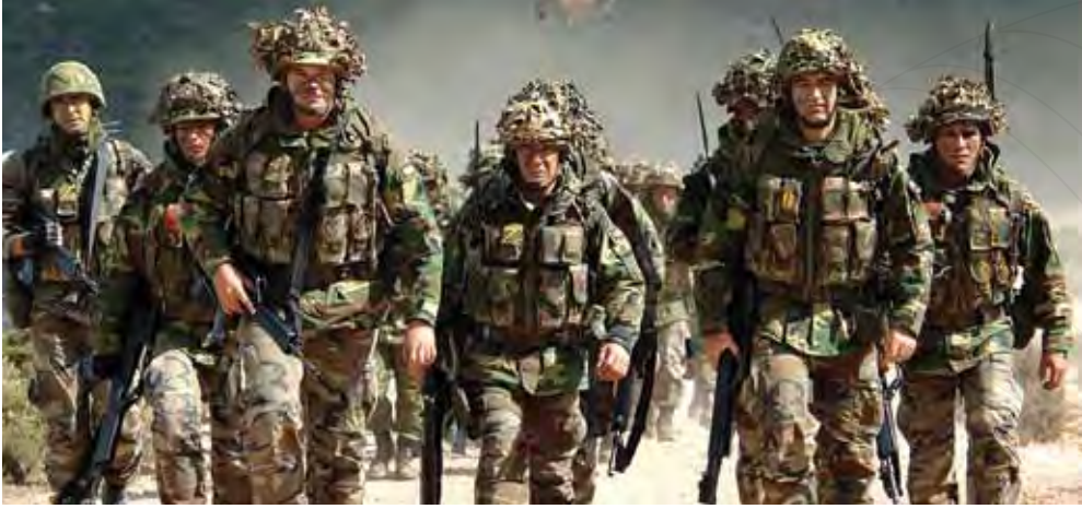
NRF exercise “Loyal Midas” 2005 Spanish soldiers, return to their base camp

Council, the Mediterranean Dialogue, and the Istanbul Cooperation Initiative. These fora bring together energy producers, transit countries and energy consumers in a dialogue on issues of mutual concern.