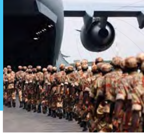
Airlift for almost 5,000 AU peacekeepers

vessels transiting through dangerous waters and has helped to increase security in the area by conducting counter-piracy operations since 2008. In 2011, NATO had an average of 4-5 ships deployed as part of the operation, as well as three maritime patrol aircraft. Operation Ocean Shield also offers training to regional countries to develop their own capacity to combat piracy. The Alliance operates in full complementarity with relevant UN Security Council Resolutions and with actions against piracy by other actors.