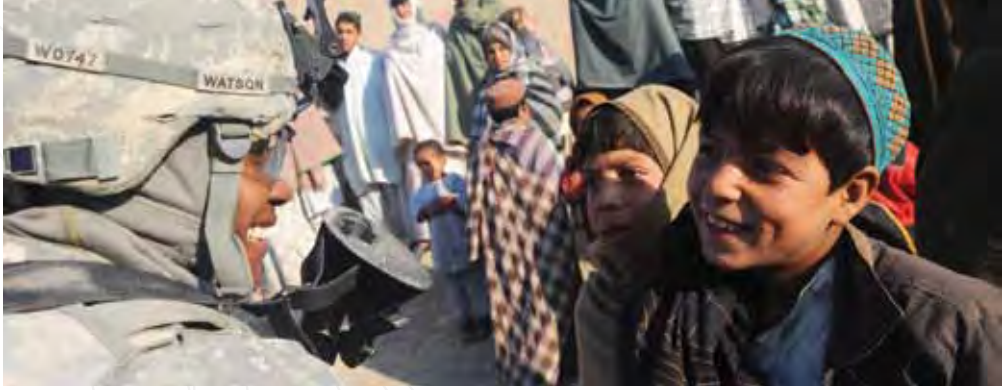
US Army soldier shares a laugh with an Afghan boy in Rajan Qala village

all provinces and districts. In 2011, over half the Afghan population saw their army and police beginning to take the lead in providing security; overall enemy-initiated attacks decreased and the insurgency was weakened.