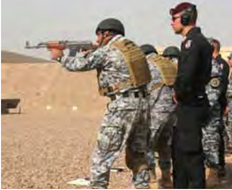
An Italian carabinieri trains Iraqi Federal Police in Camp Dublin, Baghdad