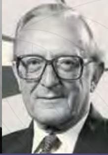
Lord Ismay 1952-1957