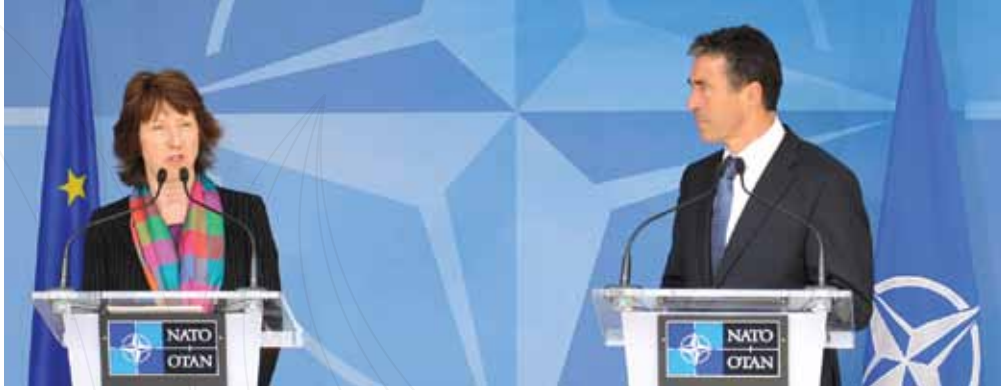
Catherine Ashton, High Representative of the European Union for Foreign Affairs and Security Policy and Anders Fogh Rasmussen, NATO Secretary General, during joint press point at NATO Headquarters

important partnership has yet to fulfil its potential, the 2010 Strategic Concept notes that “the EU is a unique and essential partner for NATO”, and close cooperation between them is an important element of the “Comprehensive Approach” to crisis management and operations. For this and other reasons, Allied leaders believe that a strong European Security and Defence Policy can only benefit NATO and foster a more equitable transatlantic security partnership.