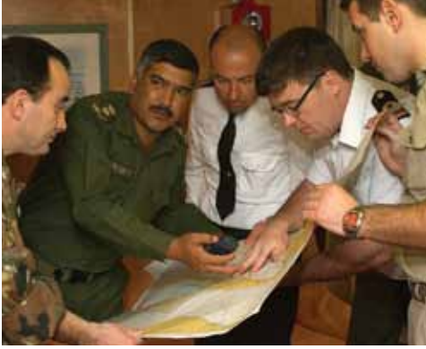
Maritime exercise with Jordan in the context of the Mediterranean Dialogue