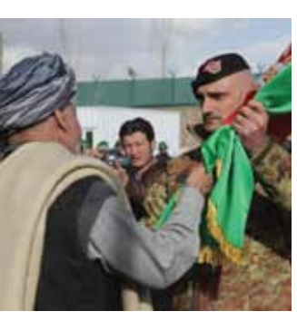
An Afghan flag is handed over during the transition ceremony in Ghor Province.