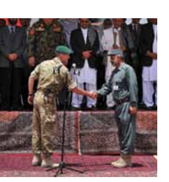
The Commander of Task Force Helmand shakes hands with Helmand's Chief of Police at the Lashkar Gah official handover ceremony.

"Afghanistan's future is clear: a country led by Afghans, defended by Afghans and working for the benefit of Afghans."