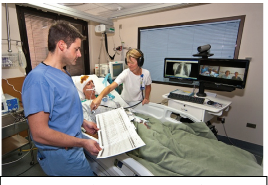
Demonstration of the Virtual Intensive Care Unit.

The Department of Veterans Affairs (VA) strives to serve Veterans and improve their lives, and the new virtual intensive care unit (vICU) helps us do that. The vICU provides access to critical care services to smaller facilities within a Veterans Integrated Service Network (VISN). There are several Tele ICU models across the country using a traditional model where a physician sits in a room and monitors patients remotely. However, in VISN 19, VA is testing an innovative vICU that is nurse-driven and nurse-managed and uses a rapid response multidisciplinary team approach taking patient care to a higher level. This higher level of care is illustrated by the following example of the vICU in action.