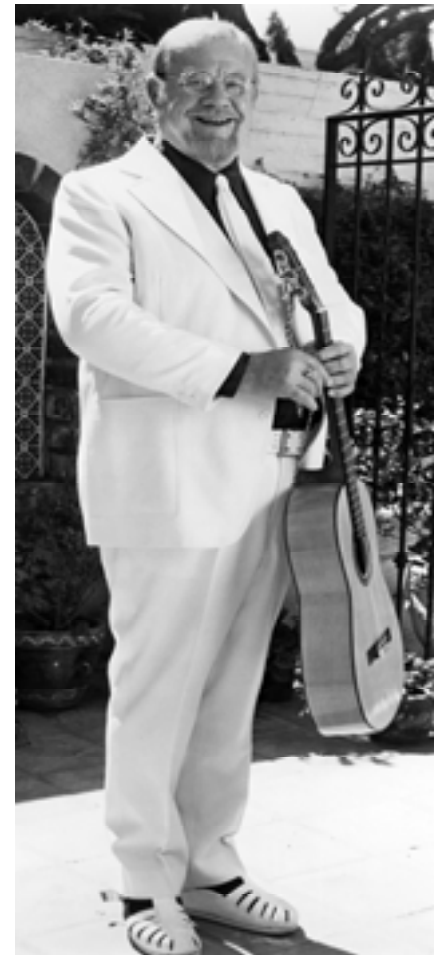
Burl Ives publicity photo from the 1950s.

April 14, 1995: Burl Ives died at age eighty-five.