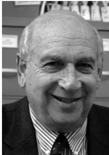
Alan Dundes.

Dundes has been important to the field of folklore for over forty years as a theorist, a teacher, and the director of an archive. In the theoretical sphere, he is best known for structuralist and psychoanalytic approaches to the analysis of folklore. An early champion of the work of Russian folktale analyst Vladimir Propp, Dundes helped bring European structuralist approaches to the study of folk narratives, not least through his own dissertation on Native American tales. He continued to publish structuralist analyses of items such as proverbs and riddles. But Dundes is even more famous for Freudian and other psychoanalytic modes of analysis. In such works as Life Is Like a Chicken Coop Ladder , "Into the Endzone for a Touchdown," and Two Tales of Crow and Sparrow , Dundes argued that folklore is frequently the expression of psychosexual impulses such as latent homosexuality or oral and anal fixations. These arguments were controversial, and Dundes gained in notoriety through his ability to steadfastly defend premises that