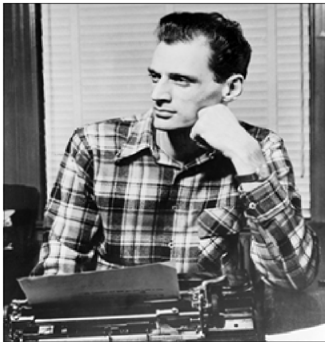
The playwright and fieldworker Arthur Miller, pictured sometime after the war.