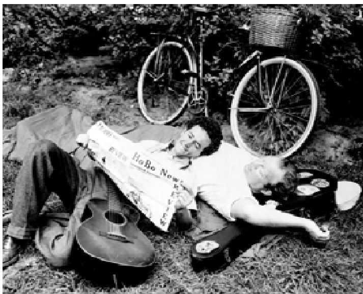
In this 1940 publicity photo from the CBS Photo Department, Woody Guthrie (l.) and Burl Ives are acting the part of hobos, lying around in Central Park, New York, before a CBS radio appearance.

Ives’s speech lamenting stringent indecency laws has re-emerged at a time when the U.S. Congress and the American people are again questioning what constitutes obscenity and what reactions to it are appropriate. New legislation on its way to the Senate would increase the individual fines paid