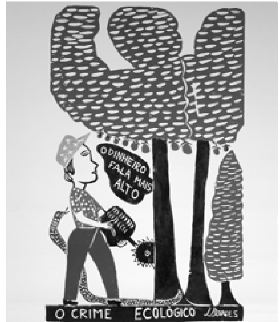
An original woodcut print, captioned "money speaks the most loudly," expresses concern for the environment. Literatura de Cordel Brazilian Chapbook Collection.

Descended from the medieval troubadour and chapbook tradition of Europe, literatura de cordel have entertained and informed the general public of Brazil for over a century, and offer insight into the popular culture of the country. In the markets of northeast Brazil, where literatura de cordel are most popular, local poets hang their little