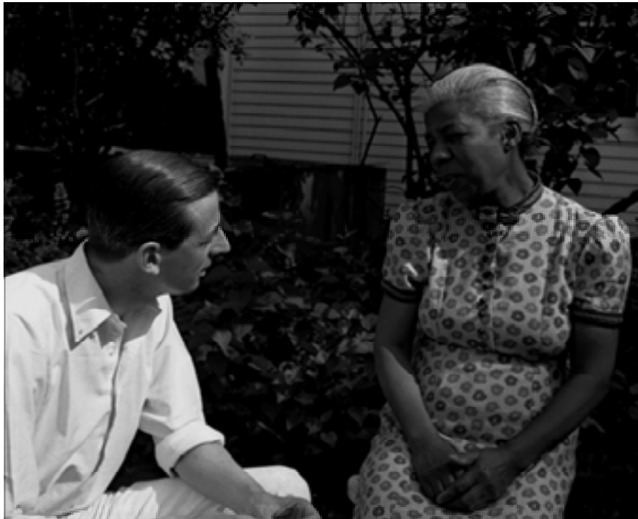
Alistair Cooke (l.) interviews an unknown woman for the BBC program I Hear America Singing in 1938. The program was one of the first to air materials in the Archive of Folk Song.