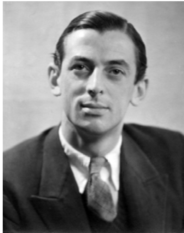
This 1932 studio portrait of Alistair Cooke was taken just before he left for his first trip to America, which lasted two years. It was on this trip that he was recorded by the American Dialect Society, on a disc that now resides in the Archive of Folk Culture.

The Times , of course, has a long memory, and when Cooke died they commented on I Hear America Singing in his obituary, alluding to a great mystery surrounding the series: how had Cooke managed to borrow recordings from the Library of Congress, when no other broadcasters had yet managed to do so? It turns out not to be such a mystery after all: Cooke simply wrote an eloquent, charming, and persuasive letter to the Librarian of Congress, Herbert Putnam, a copy of which is held in the Archive of Folk Culture. "When I first became interested in American folk songs," Cooke wrote, "I had no idea so little had been done in recording, and