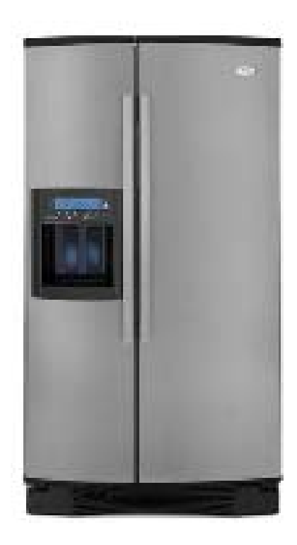
Figure 2 Side-by-side style refrigerator