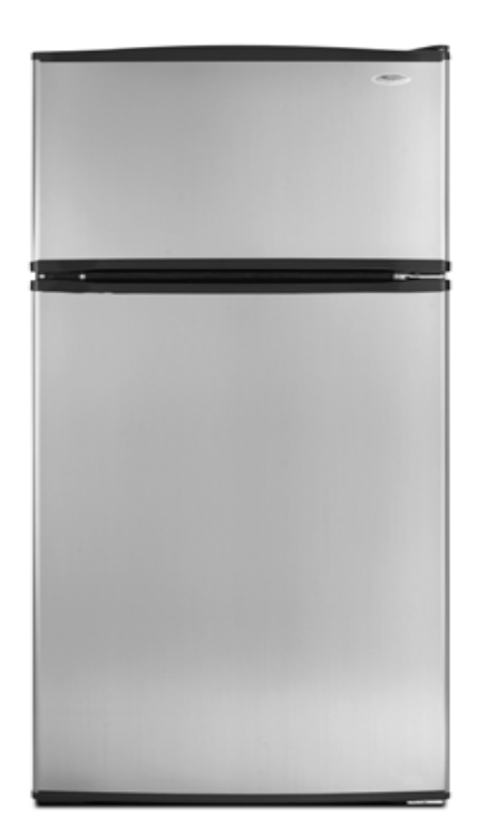
Figure 1 Top mount style refrigerator