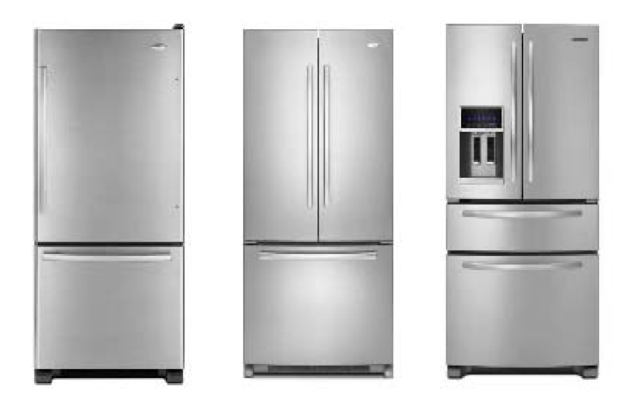
Figure 3 Bottom mount refrigerators: Two-door style, French door style, Four door, French door style

The four door, french door bottom mount refrigerator configuration has dual doors that access the refrigerator compartment and two pull-out drawers. The dual refrigerators doors are hinged to open as "french doors" to access one refrigerator compartment. In this configuration, the fourth "door" (the second freezer drawer) is typically used for refrigeration, freezing, soft-freezing, or is temperature adjustable to select any of those options.<sup>13</sup>