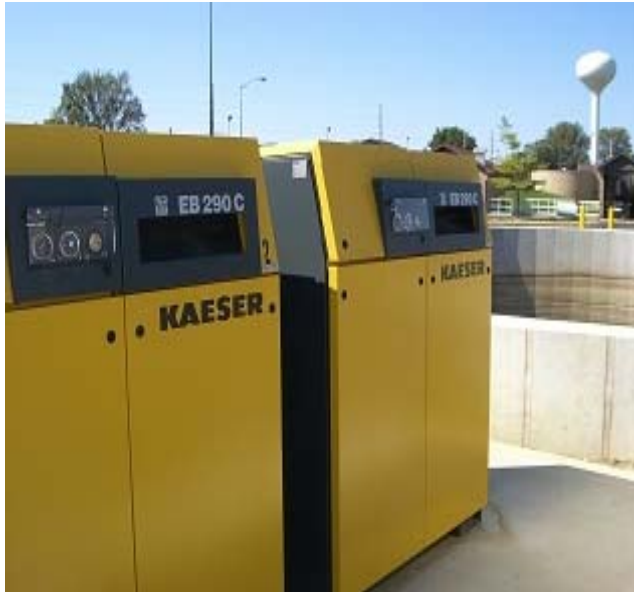
Kaeser blowers.

valves, fan motors, gauges, and switches. Depending on the size and complexity of the specification, additional wiring and setting of ancillary devices may be required. Each unit requires 16 to 20 hours to build. The assembly procedures, combined with the U.S.–sourced items, account for 35 to 50 percent of the package’s total value.