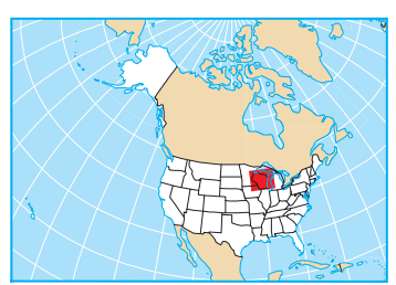
U.S. Department of the Interior U.S. Geological Survey