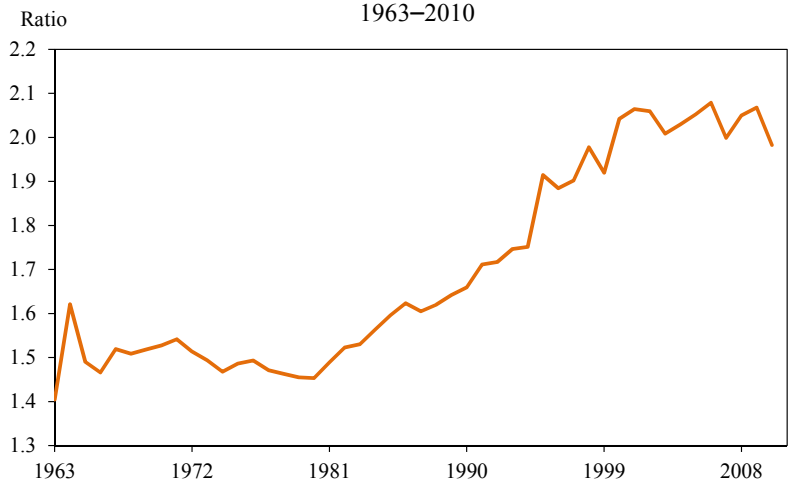
Figure 1-4 Earnings Ratio: College Degree or More to High School Degree,

Source: CEA calculations using March Current Population Survey data for workers aged 25-65 who worked at least 35 hours a week and for at least 50 weeks in the calendar year. Before 1992, education groups are defined based on the highest grade of school or year of college completed. Beginning in 1992, groups are defined based on the highest degree or diploma earned. Earnings are deflated using the CPI-U. Calculations are based on survey data collected in March of each year and reflect average wage and salary income for the previous calendar year.