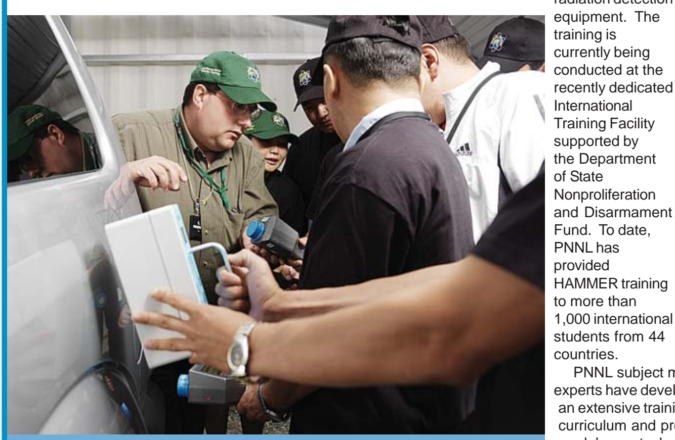
RADIATION DETECTION DEVICES: The focus of the Second Lind of Defense/Customs Border Patrol Training is to prepare officers to intercept smuggled nuclear and radiological materials to reduce or eliminate the threat of nuclear proliferation and nuclear terrorism. Handheld radiation detection devices play an integral role in the detection of possible threats for both homeland and international border crossings.

Pacific Northwest National Laboratory (PNNL), the lead training lab for the SLD program, utilizes the world class HAMMER facility for comprehensive hands-on training and real-life skills development on an array of radiation detection