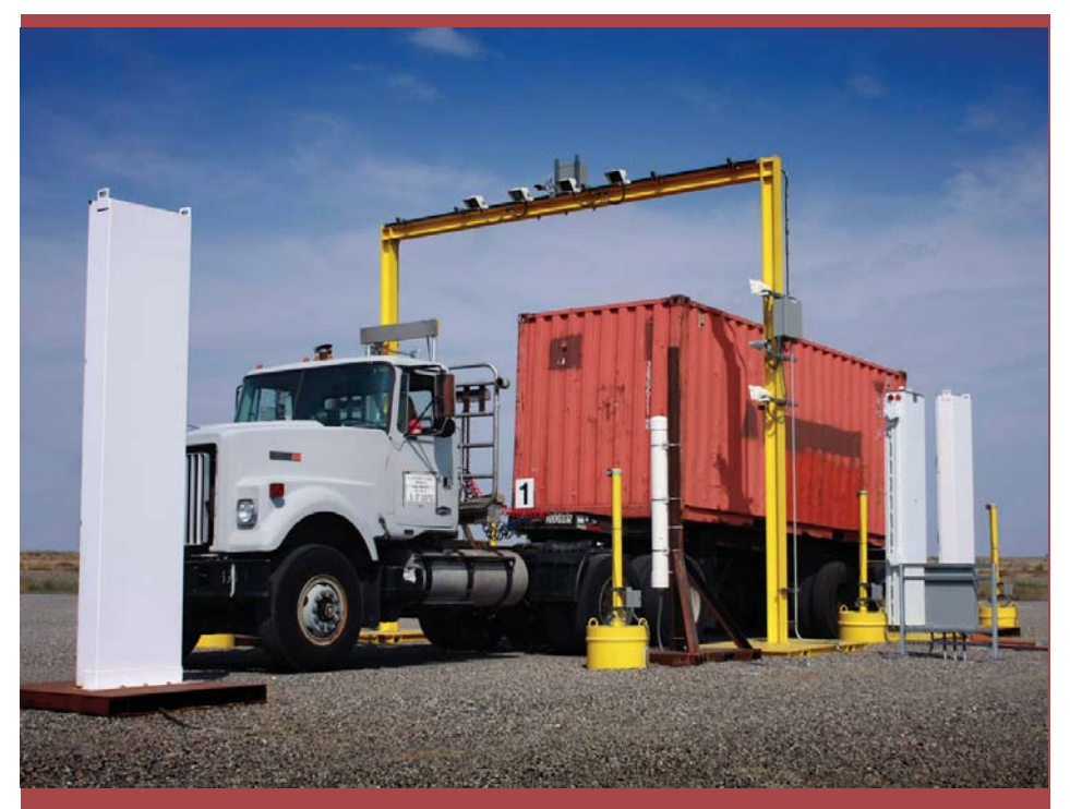
DETER, DETECT AND INTERDICT: A container with naturally occurring radioactive material is processed through a radiation portal monitor during training designed to protect against trafficking of nuclear and other radioactive materials across international borders and points of entry and exit. See pages 4 and 5 for more on the NNSA Second Line of Defense Program's comprehensive training efforts.