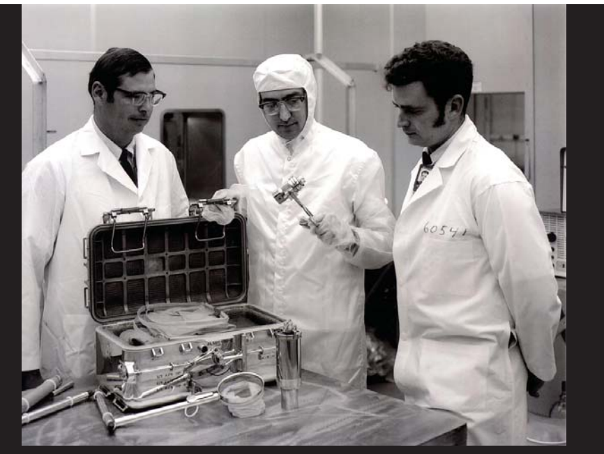
HISTORY MADE POSSIBLE: Y-12 experts inspect this moon box and its components.

To watch an informational video about the moon boxes, visit the NNSA YouTube channel at www.youtube.com/NNSANews.