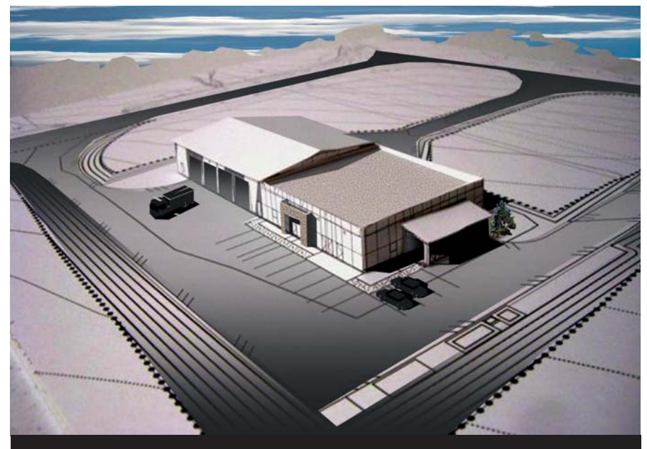
FIRE STATION MODERNIZATION: Work has begun on two new fire stations at the Nevada Test Site (NTS) that, together, will encompass more than 40,000 square feet of space and allow cover for NTS Fire and Rescue's growing fleet of emergency response vehicles. The first station is located at Mercury; the second will be located 22 miles north of the first.

Two new fire stations will be constructed at the Nevada Test Site (NTS) as part of a subcontract awarded by NNSA's Nevada Site Office (NSO) and National Security Technologies LLC (NSTec), the management and operations contractor for the NTS.