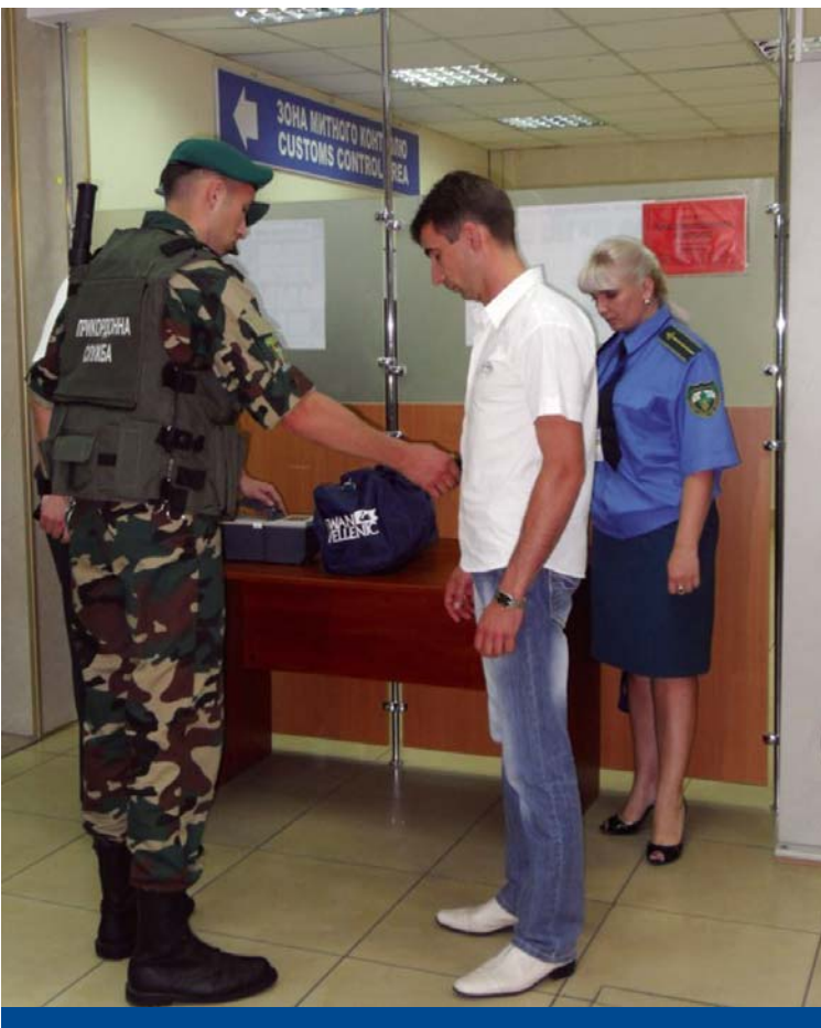
ENHANCING NUCLEAR SECURITY: A State Border Guard Service of Ukraine officer demonstrates radiation detection equipment during the Second Line of Defense commissioning ceremony at the Odessa Airport in Ukraine.

NNSA's Megaports Initiative provides radiation detection equipment, training and technical support to key foreign seaports to enable them to scan cargo containers for nuclear and other radioactive materials, regardless of container destination. Around the world, the Megaports Initiative is