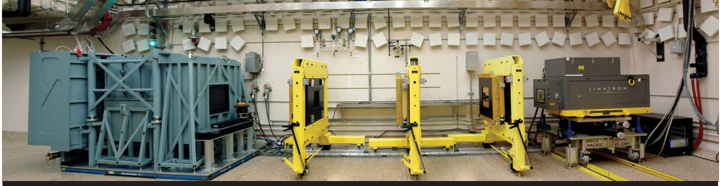
CT SCAN FOR WEAPONS: X-rays from a 9-megaelectronvolt (MeV) linear accelerator (far right) travel through three tungsten collimators to the heavily shielded Confined Large Optical Scintillator Screen and Imaging System (CoLOSSIS).