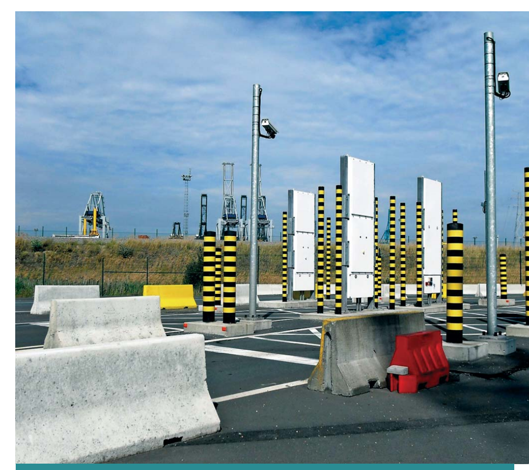
VALUABLE PARTNERSHIPS: NNSA's Second Line of Defense program partners with small businesses for international installation of radiation portal monitors similar to the ones pictured here.

headquarters in Washington, D.C. These blanket purchase agreements represent 11 teams of more than 80 small businesses and are open for use by any DOE department. NNSA has access to this large