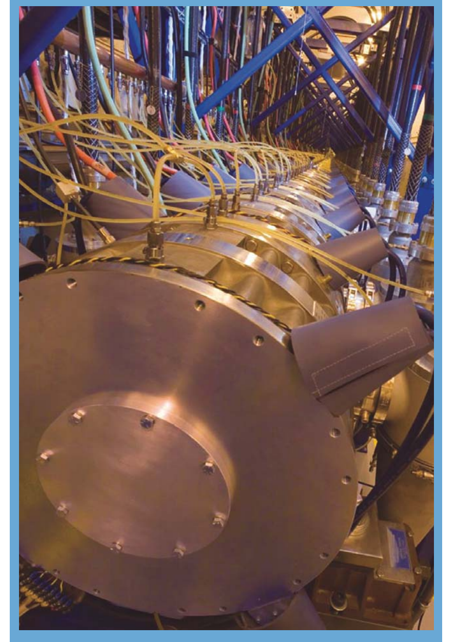
DARHT CELLS: The 3-foot-diameter induction cells of DARHT's first axis.

"Initial indications show excellent data return," said the hydrodynamic