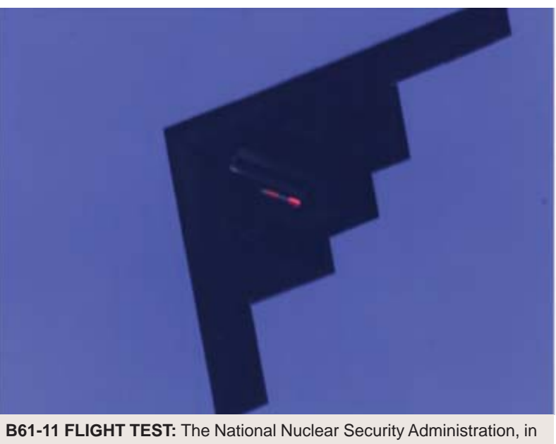
collaboration with the U.S. Air Force Global Strike Command, recently conducted a successful surveillance flight test using a Joint Test Assembly (JTA) of the B61 Mod 11 (B61-11) Strategic Bomb.

NNSA in collaboration with the U.S. Air Force Global Strike Command, recently conducted a