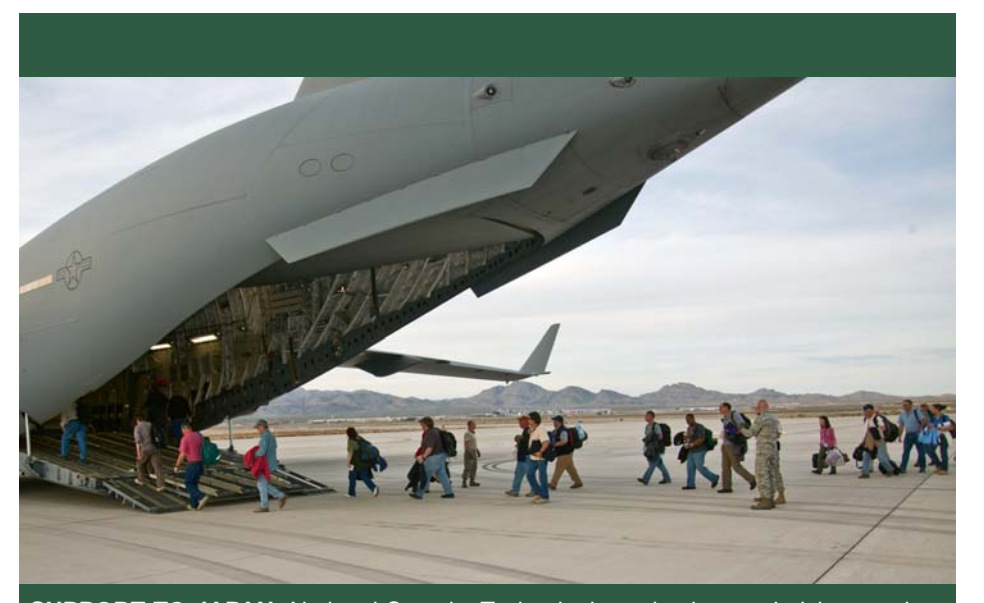
SUPPORT TO JAPAN: National Security Technologies scientists, technicians and engineers from the National Nuclear Security Administration's (NNSA) Nevada Site Office board the Air Force C-17. Highly trained nuclear emergency response personnel and more than 17,000 lbs. of high-tech equipment are being sent to Japan as part of the Department of Energy and NNSA's effort to assist Japanese personnel with nuclear issues.