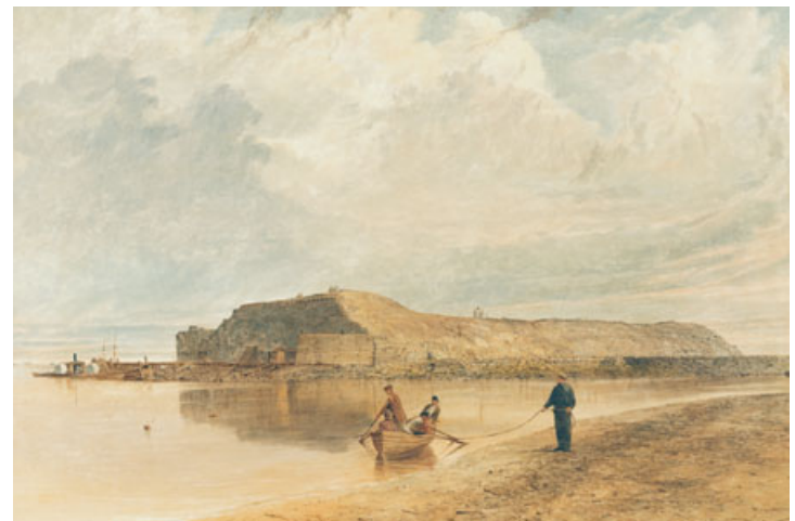
Fort Sumter, South Carolina (after the war) by Seth Eastman, 1870. (House Fine Arts Board. Photo courtesy Architect of the Capitol)