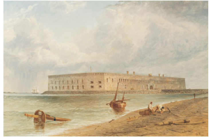
Fort Sumter, South Carolina (before the war) by Seth Eastman, 1871. (House Fine Arts Board. Photo courtesy Architect of the Capitol)