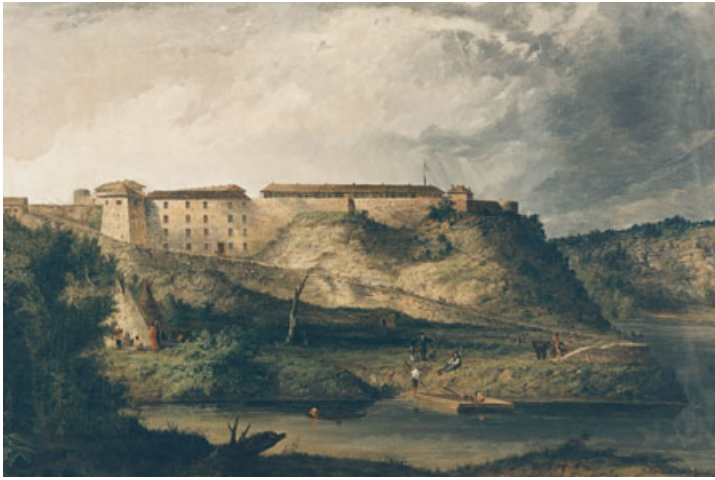
Fort Snelling, Minnesota by Seth Eastman, 1870–1875. (House Fine Arts Board. Photo courtesy Architect of the Capitol)