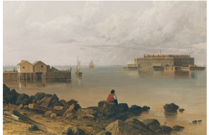
Fort Lafayette, New York by Seth Eastman, 1870–1875. (House Fine Arts Board. Photo courtesy Architect of the Capitol)