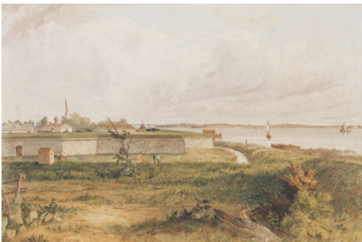
Fort Mifflin, Pennsylvania by Seth Eastman, 1873. (House Fine Arts Board.)