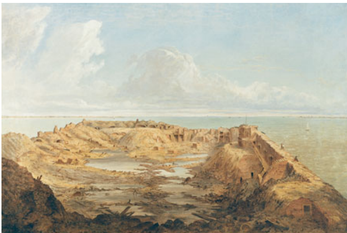
Fort Sumter, South Carolina (after the bombardment) by Seth Eastman, 1870–1875. (House Fine Arts Board. Photo courtesy Architect of the Capitol)