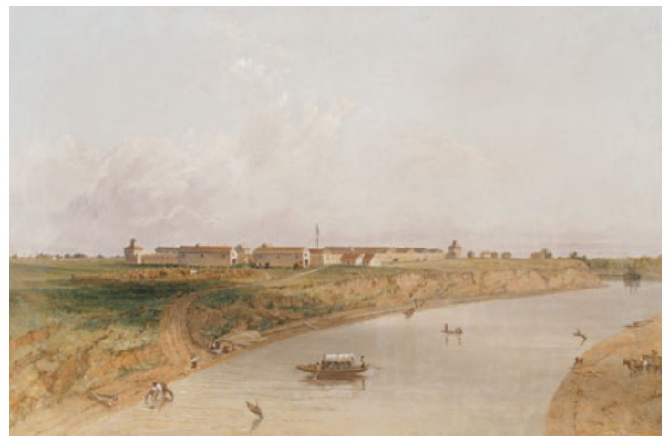
Fort Rice, North Dakota by Seth Eastman, 1873. (House Fine Arts Board. Photo courtesy Architect of the Capitol)