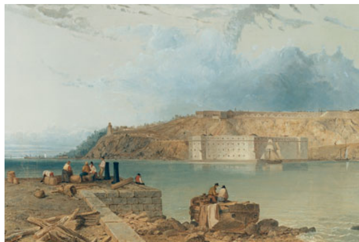
Fort Tompkins and Fort Wadsworth, New York by Seth Eastman, 1870–1875. (House Fine Arts Board.)