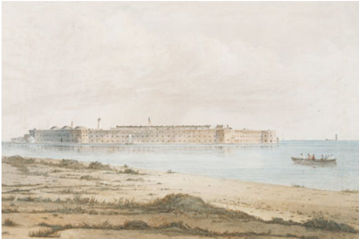
Fort Jefferson, Florida by Seth Eastman, 1875. (House Fine Arts Board.)