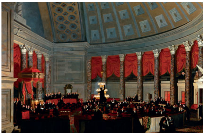
The Old House of Representatives , painted by Samuel F.B. Morse in 1822, was the artistic precedent for Adèle Fassett's Electoral Commission .

The Electoral Commission held its first public hearing on February 1, 1877, and deliberations continued for nine days. Legislators, cabinet members, the press, and prominent men and women of Washington society crowded into the Capitol's Old Senate Chamber (then serving as the Supreme Court's regular meeting place). The long and bitter debate began with the Florida case. Although Tilden had almost certainly won in the electoral balloting, Republicans prevailed and the commission's vote went to Hayes. Subsequent voting also followed party lines, with Bradley, the "independent" justice, joining the Republicans. By the findings of the commission, Rutherford B. Hayes received all of the disputed votes, and thus the required one-vote margin over Tilden. Though Democrats at first protested, they ultimately accepted the decision on the promise that federal troops would be removed from the South and Reconstruction brought to an end. Congress declared Hayes the victor on March 2, just two days before his term began.