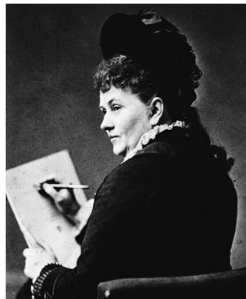
C. Adèle Fassett's self-portrait was based on a Mathew Brady photograph of the artist.

Fassett's painting has one significant precedent in American art: Samuel F.B. Morse's The Old House of Representatives , completed in 1822. That much larger painting shows a similar space, the House Chamber, from the same viewpoint as later selected by Fassett: the left side of the room and slightly above the head level of those on the main floor. This allowed a clear view of many faces. Fassett certainly knew