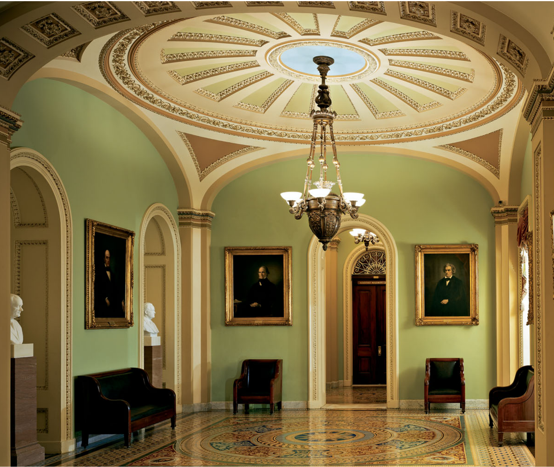
Marble busts of vice presidents and portraits of notable senators are displayed in the second floor corridor of the Senate wing. Left to right: Paintings of Daniel Webster, Henry Clay, and John C. Calhoun. (1999 photograph)