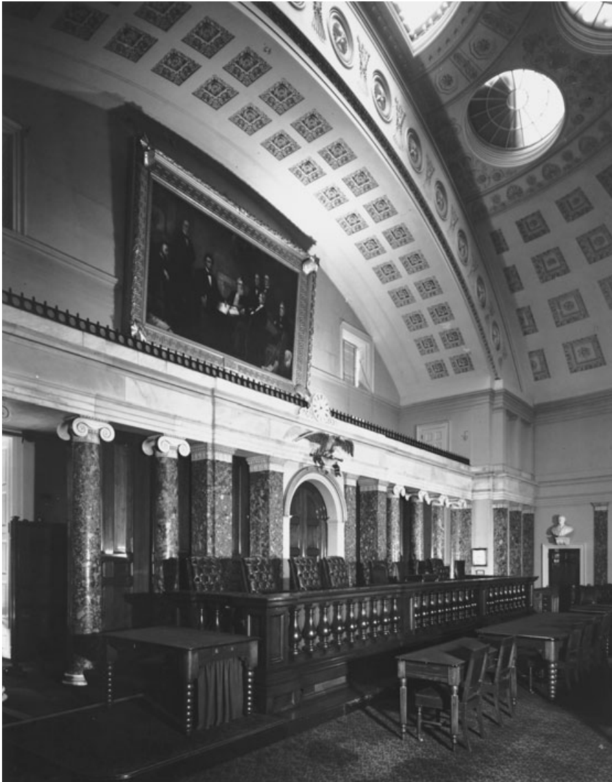
The Senate's painting, First Reading of the Emancipation Proclamation by Francis B. Carpenter, on display in the Supreme Court Chamber in the Capitol in 1958.