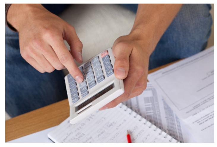
from the Committee on House Administration.

For all questions relating to equipment and equipmentrelated issues, refer to the User's Guide to Purchasing Equipment, Software, and Related Services, available