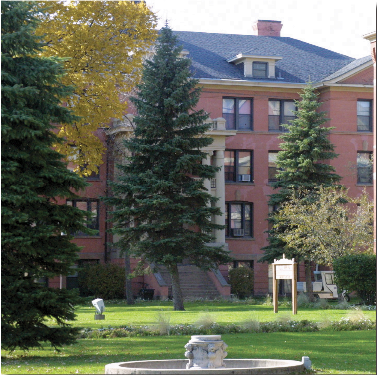
Cover: Main Building at Mayville State University This page: West Main