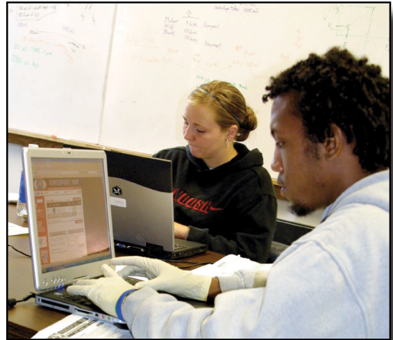
Mayville students compiling biomedical research

Making sure that North Dakota's colleges and universities are strong will help ensure we have the intellectual capital to address challenges facing our state, that we have a world-class workforce, and that our young people can envision a secure and prosperous future for themselves in North Dakota.