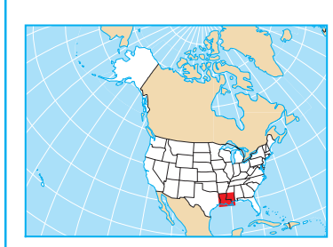
U.S. Department of the Interior U.S. Geological Survey