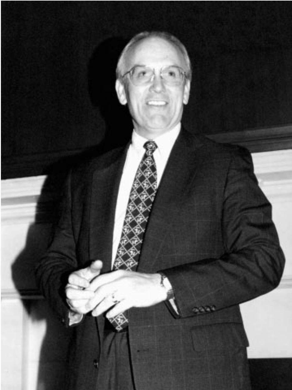
Larry E. Craig, Chairman, Senate Republican Policy Committee.