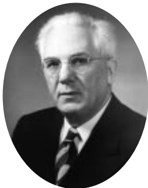
Homer Ferguson (Michigan) 1954