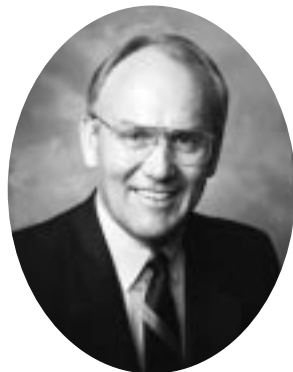
Larry Craig (Idaho) 1996-