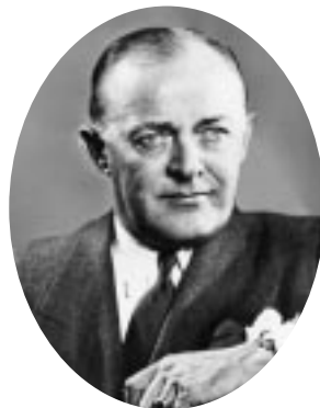
H. Styles Bridges (New Hampshire) 1955-1961