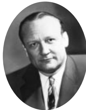
William F. Knowland (California) 1953