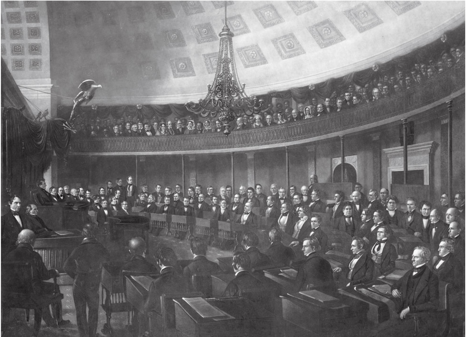
In his 1846 engraving of the United States Senate Chamber, Thomas Doney depicted the eagle and shield above the canopied dais.