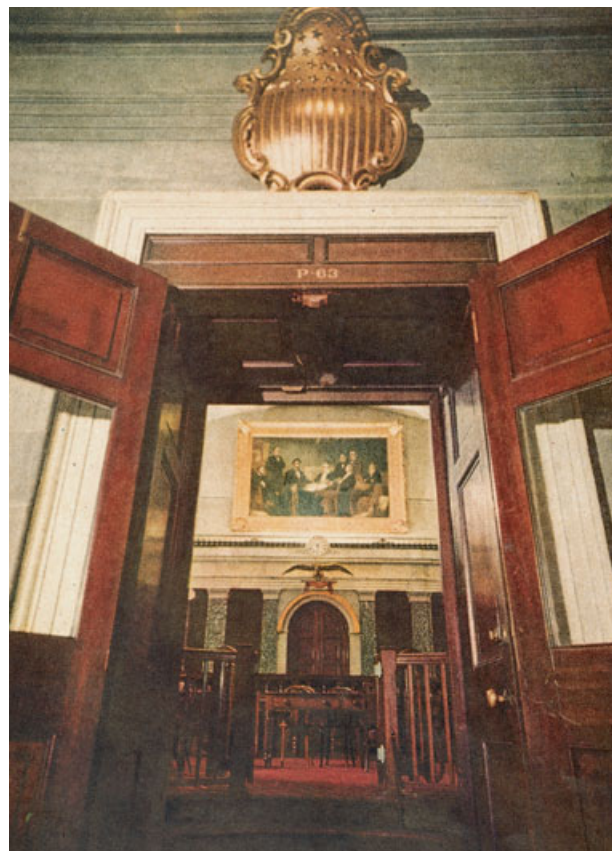
The Supreme Court, which occupied the Old Senate Chamber for 75 years, moved the shield to the Chamber's entrance while the eagle remained inside.

room appears in an 1838 article in the Daily National Intelligencer . It describes a "rich burnished shield, with an outer margin in the old French style, surmounted by an eagle of the size of life" hanging above the vice president's dais in the room. 1 From this report it appears that the shield we know today existed from at least 1838, although the official records remain unclear on the matter. In 1846, Senate records indicate payment for "taking down curtains and drapery & irons for Eagle & shield." The eagle and shield also appear in two mid-19th-century engravings: Thomas Doney's United States Senate Chamber , published in 1846, and Robert Whitechurch's The United States Senate , A.D. 1850, dated 1855. In