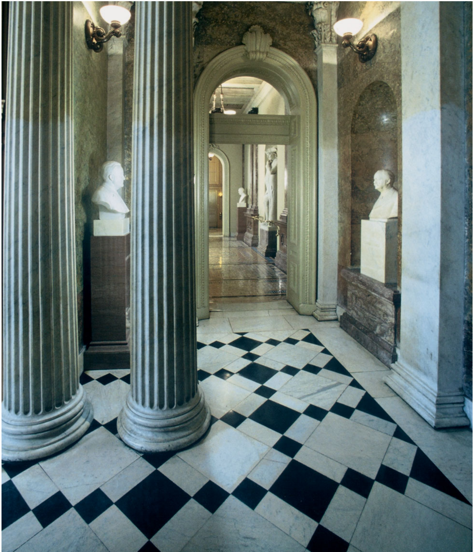
Second floor corridor, Senate wing.