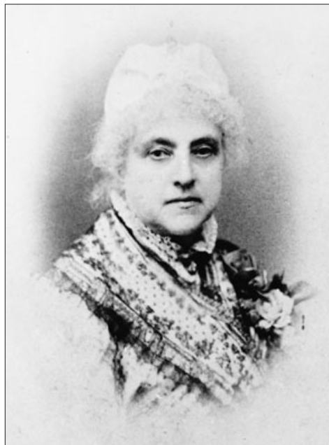
Delaware native, Civil War nurse, and sculptor Sarah Fisher Ames. (Architect of the Capitol)

In 1860 Lincoln was elected the nation's first Republican president. By the