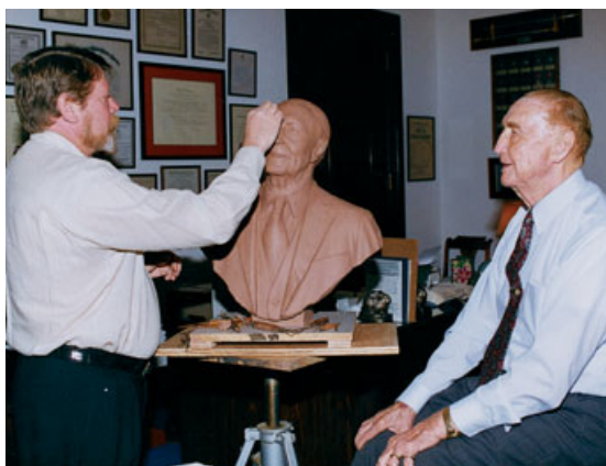
Frederick Hart and Strom Thurmond in the senator's office (SR-219) in the Russell Senate Office Building, 1997.

The artist is also represented in the Senate by a statue of Senator Richard Russell (p. 324) in the Russell Senate Office Building. Hart was working on a bust of Dan Quayle (p. 312) for the Senate's Vice Presidential Bust Collection at the time of his death in 1999.