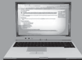
Table of contents Podcasts Ahead of Print Medscape CME Specialized topics