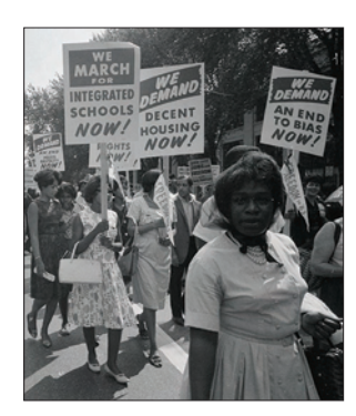
Civil rights march on Washington, D.C.

presented by urban life in the North, and as they became increasingly recognized in politics, sports and the arts, a social revolution began. A new generation of activists demanded that the U.S. government provide all its citizens with the rights and protections guaran-