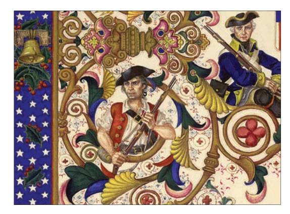
Bill of Rights - Illustration

They met in Philadelphia in May 1787. Fifty-five men from 12 different states gathered, intending to revise the Articles of Confederation. As they began their meetings, however, Virginia Governor Edmund Randolph presented a plan prepared by James Madison.