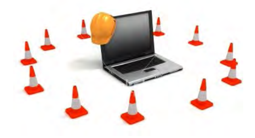
TAB A Is Currently Under Construction