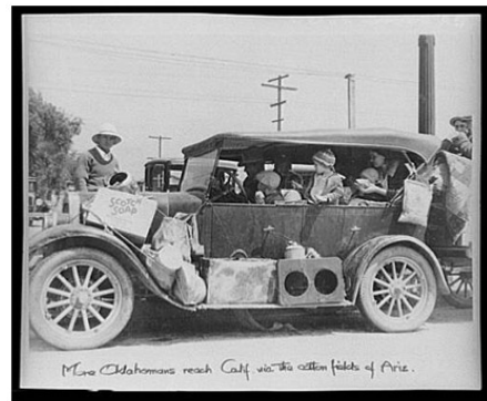
"Oklahoma dust bowl refugees. San Fernando, California." June 1935.

http://www.loc.gov/teachers/tps/quarterly/inquiry_learning/pdf/elementary_activity.pdf