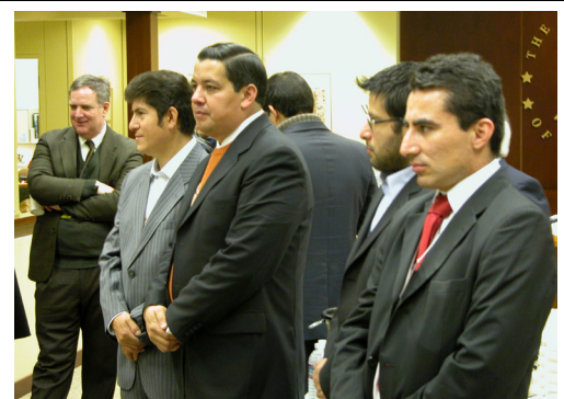
Colleagues from GLIN. Ecuador and GLIN. Colombia meet with staff members of the Law Library of Congress.