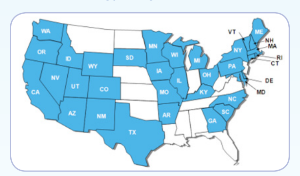
Blue states have utilities that offer incentives for energy-efficient CFS equipment

Find out if there are incentives in your area by visiting: www.energystar.gov/cfs/incentives.