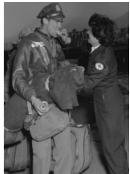
Red Cross woman feeding a serviceman, Italy, 1944. (VHP/Olen/Coll. 2008)

The project also faces challenges in 2004. The urgency to get interviews increases. World War II and Korean War veterans are aging; the urgency to capture their personal histories is pressing. Among the most serious issues faced by the project are the massive inflow of material and the pressure to make it quickly accessible to researchers and the public. There is an increased need for vigilance in processing and storage and an increased demand for staff time to share the collections with the public. A partial answer is through the creation of public exhibitions, additional radio and television programs, and more publications, perhaps more books, as well as print media articles. If the success of the Veterans History Project and demand for its materials are its major challenges, then the future of the project is assured.