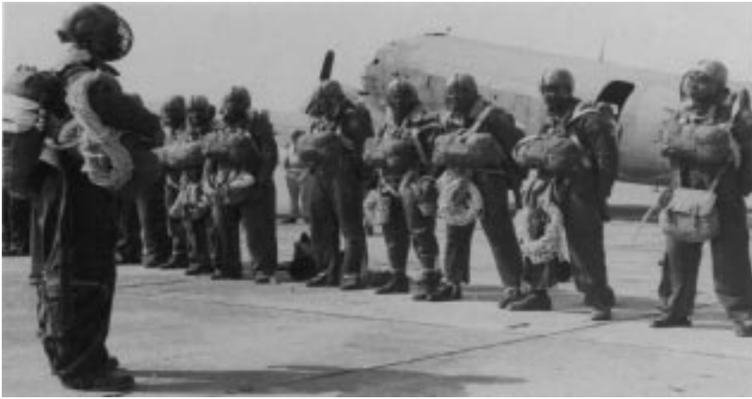
555th Airborne waiting for a routine equipment check. These men were trained by the U.S. Forest Service Smokejumpers to jump to forest fires.

“We as colored soldiers in Ft. Benning, Georgia, in 1941 and '42, could not go into the main Post Exchange or the main theater in Ft. Benning, Georgia. When we passed the main Post Exchange and looked in we could see the German and Italian prisoners of war sitting down at the same table with white soldiers, drinking cokes and smoking and having a good time. So it is understandable how colored soldiers would have an inferiority complex. [We thought] there must be something wrong with us. We are in uniform . . . but we are not good enough to sit at the table with the prisoners of war.”