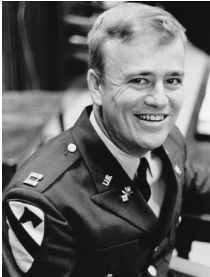
Vietnam veteran Max Cleland in the 1960s. A former U.S. senator from Georgia and an American war hero, Cleland lost both his legs and his right arm when a grenade exploded during his service in Vietnam. Cleland was only thirty-four years old when President Jimmy Carter appointed him head of the Veterans Administration.

E mbraced with enthusiasm by the nation, the VHP currently has partner organizations located in all fifty states, the U.S. territory Guam, the Nez Perce tribal government, and one foreign government, Greece, which is host to an American school. The