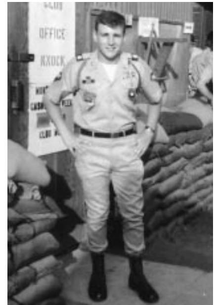
Chuck Hagel in Vietnam, 1968. Currently the U.S. senator from Nebraska, Chuck Hagel served with his brother in Vietnam, where they walked side by side as infantry squad leaders with the U.S. Army’s 9th Infantry Division.

The Hagel brothers survived their wounds and the war. Chuck became a successful businessman and was elected in 1996 to the first of two terms in the U.S. Senate. He was one of the original Senate sponsors, along with Max Cleland, of the Veterans History Project, and serves on its Five Star Council.