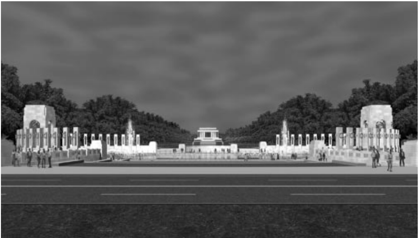
The National World War II Memorial on the National Mall, view from 17th Street. Artist's rendering by Joonan Lee.