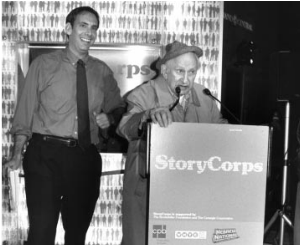
David Isay and Studs Terkel in front of the recording booth in Grand Central Terminal, New York City, October 23, 2003, at the opening ceremony launching StoryCorps, a new national oral history project.