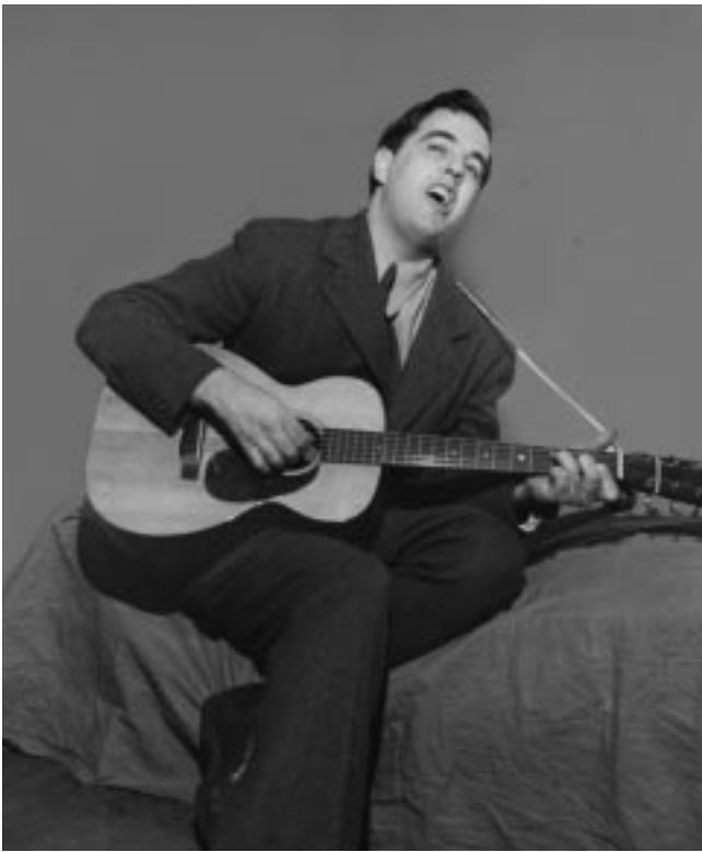
Alan Lomax playing guitar, 1940.

field, Ferdinand “Jelly Roll” Morton, and David “Honeyboy” Edwards. In 1938, at the Library of Congress, he recorded Jelly Roll Morton for over eight hours of singing, playing, and spoken recollections, and in 1940, at the Department of the Interior, he recorded Woody Guthrie for over four hours of songs and stories.