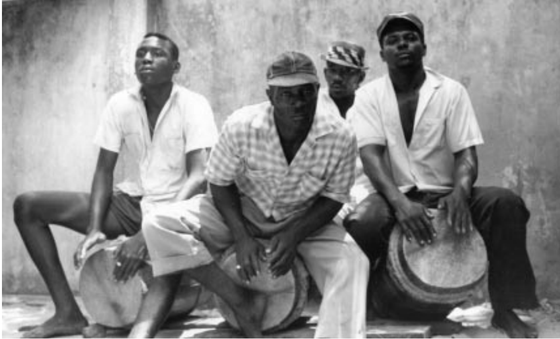
Men playing drums, Mayoro, Trinidad, 1962.