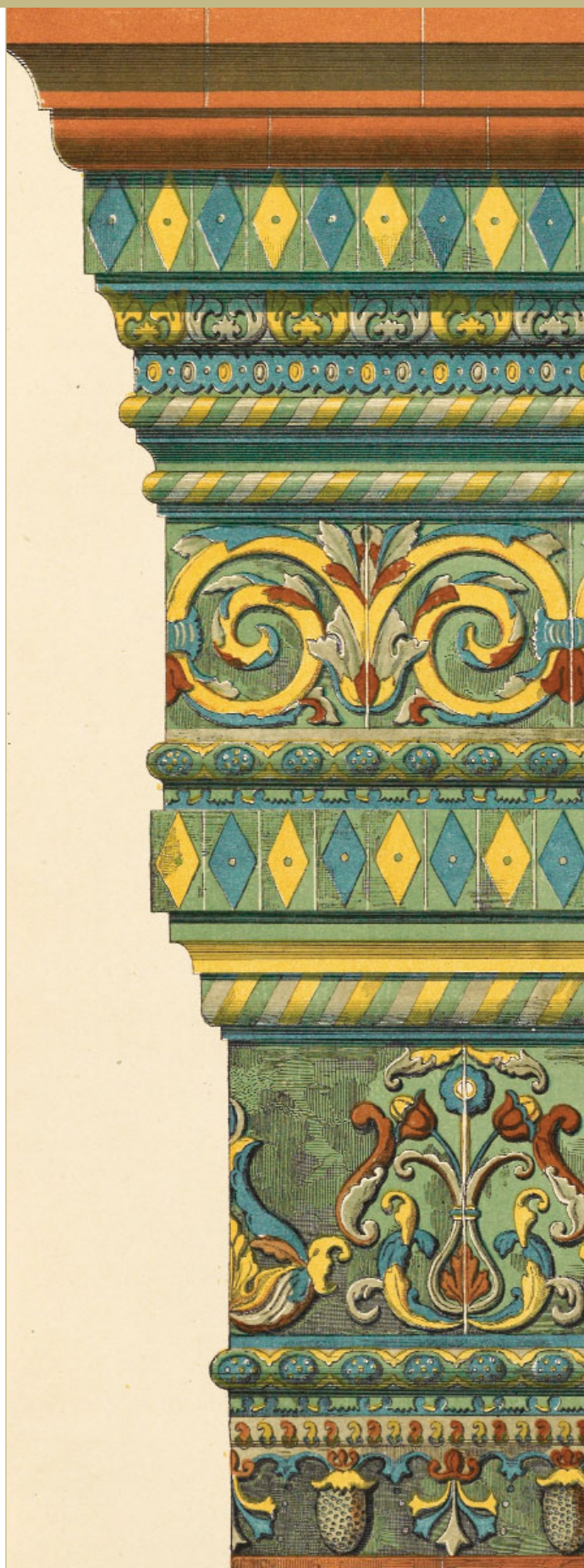
Cornice of the entryway of the Church of St. Nicholas the Wonderworker in Yaroslavl.

These financial statements should be read only in connection with the accompanying notes to financial statements.