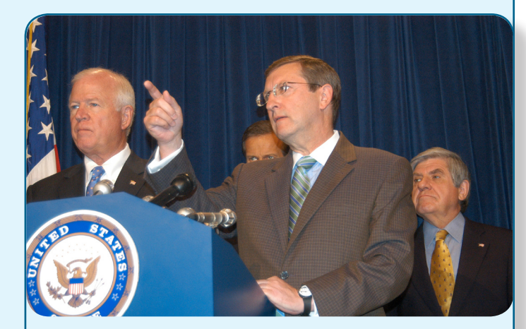
The New Era Energy Bill was the work of a bipartisan group of 10 senators, led by Senator Conrad and Senator Saxby Chambliss, Republican of Georgia, who joined Senator Conrad at the Aug. 1 press conference unveiling the framework. Others included Sen. John Thune, R-S.D., and Sen. Ben Nelson, D-Neb.

• The bill would responsibly increase domestic energy production – including increased drilling – and boost incentives for clean coal technology and coal-to-liquid fuel plants.