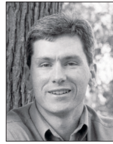
Officer Johnny Michael Spann, 32 Winfield, Alabama

Counterterrorism Center, Central Intelligence Agency