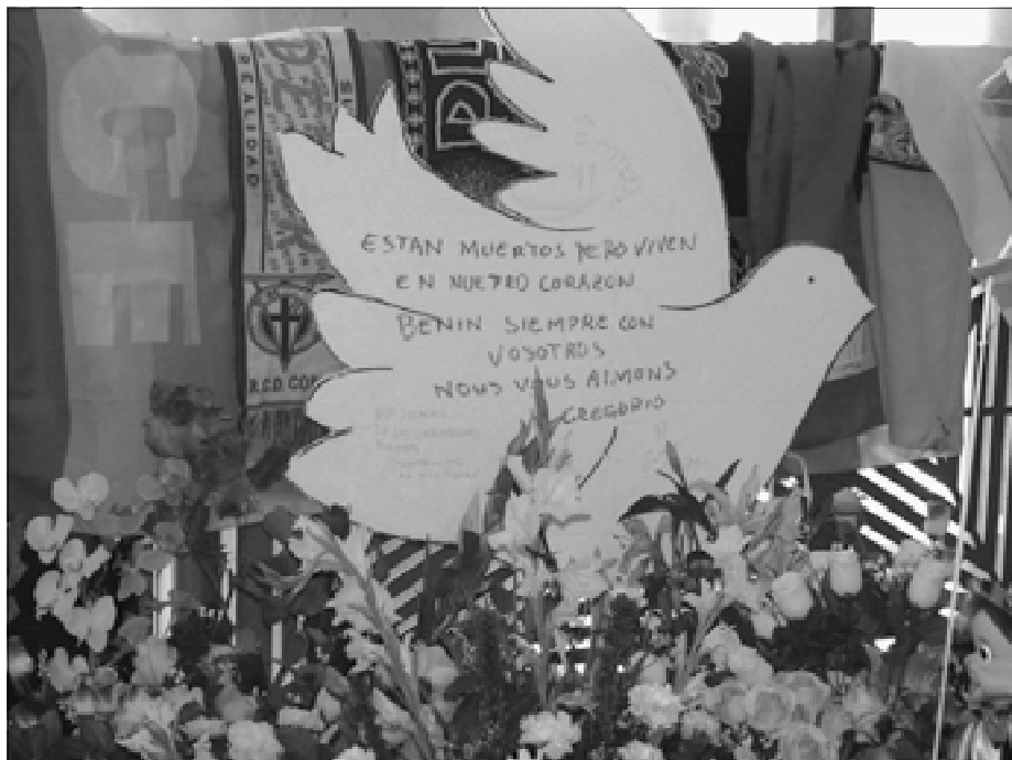
A spontaneous shrine erected in response to the 2004 Madrid subway bombings.