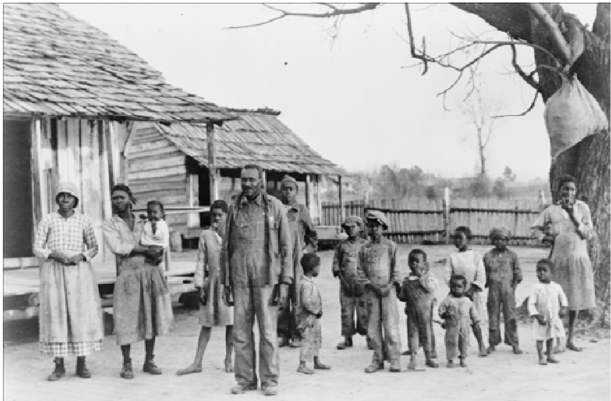
A sharecropper's family at Gee's Bend in 1939.