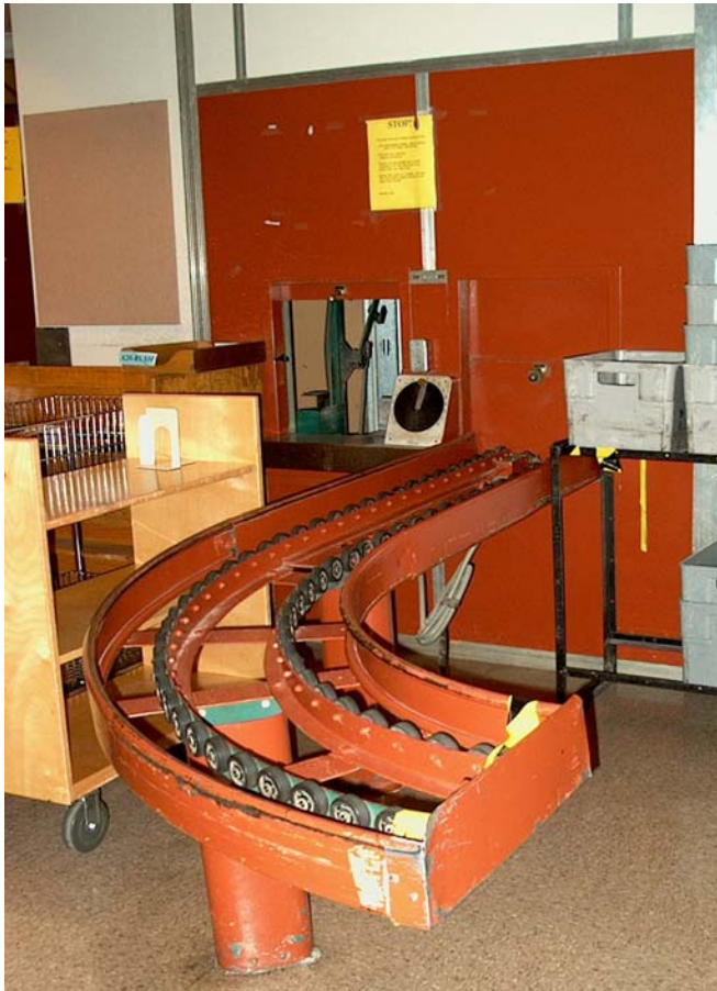
Section of the book conveyor system in the Jefferson Building.

The Law Library and CALM have managed to efficiently and effectively transport books and materials since the demise of the conveyor between 2006 and 2008. Neither organization has increased staffing levels, choosing instead to reallocate existing resources. Moreover, customers report that manual deliveries are faster and more reliable than the book conveyor was.