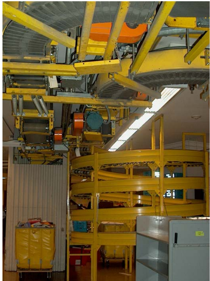
Section of the book conveyor system in the Jefferson Building.

The cost to manually transport materials is approximately $129,000 per year. CALM currently employs three full-time staff to deliver materials between the Madison, Jefferson, and Adams buildings at an estimated annual cost of $116,000. The Law Library, which uses CALM employees to transport material to the Jefferson and Adams Buildings, has six technicians who help move material between the Law Library's stacks and reading room, both of which are located