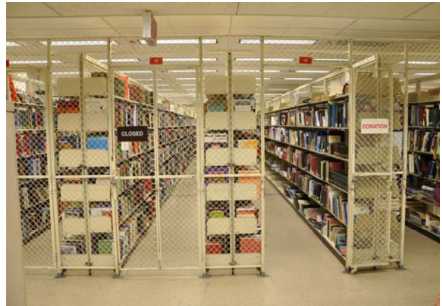
Figure 3: Image of book bays in the Surplus Books Program.

We also conducted a participant survey to evaluate the level of compliance, on the part of program participants, with the rules as described in the participation letter (see footnote 4). In addition to many comments complementing the Library about this program, we noted one university participant that responded identified itself as a "for profit" educational body.