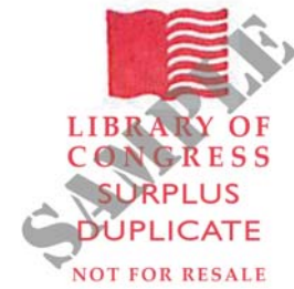
Figure 4: Example of Surplus Books Program identification stamp.

Management concurred with our recommendations.