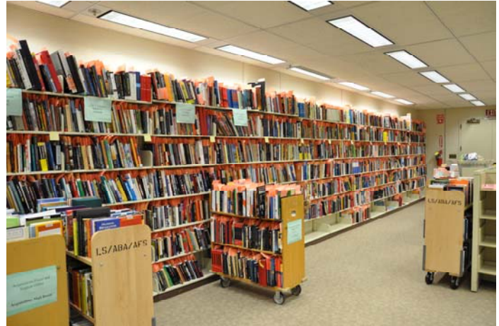
Figure 1: Image of CIP and Copyright submission material.

Applying specified criteria, ABA assesses and processes all excess materials qualifying for transfer to the Duplicate Materials Exchange Program (DMEP), the National Library of Medicine (NLM), and the National Agriculture Library (NAL). Through DMEP, the Library and its approximately 4,000 partner organizations around the world exchange materials as part of their collection acquisition programs. Likewise, the Library provides medical books and agricultural materials to NLM and NAL as well as transferring audio tapes and compact discs to the National Library Service for the Blind and Physically Handicapped. ABA places materials not qualifying for DMEP, NLM, or NAL into the SBP.