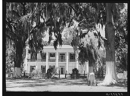
Old Jackson Plantation home, owned by a sugarcane planter

Library of Congress Bibliographic record: http://hdl.loc.gov/loc.pnp/cph.3c03293