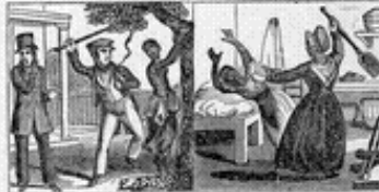
Showing how slavery improves the condition of the female sex.