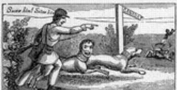
Savagery of the Northern States in arresting and returning fugitive Slaves.