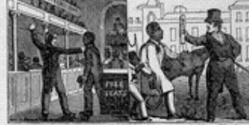
The Negro Pen, or "Free" Seats for black Christians. Mayor of New-York refusing a Carman's license to a colored Man.