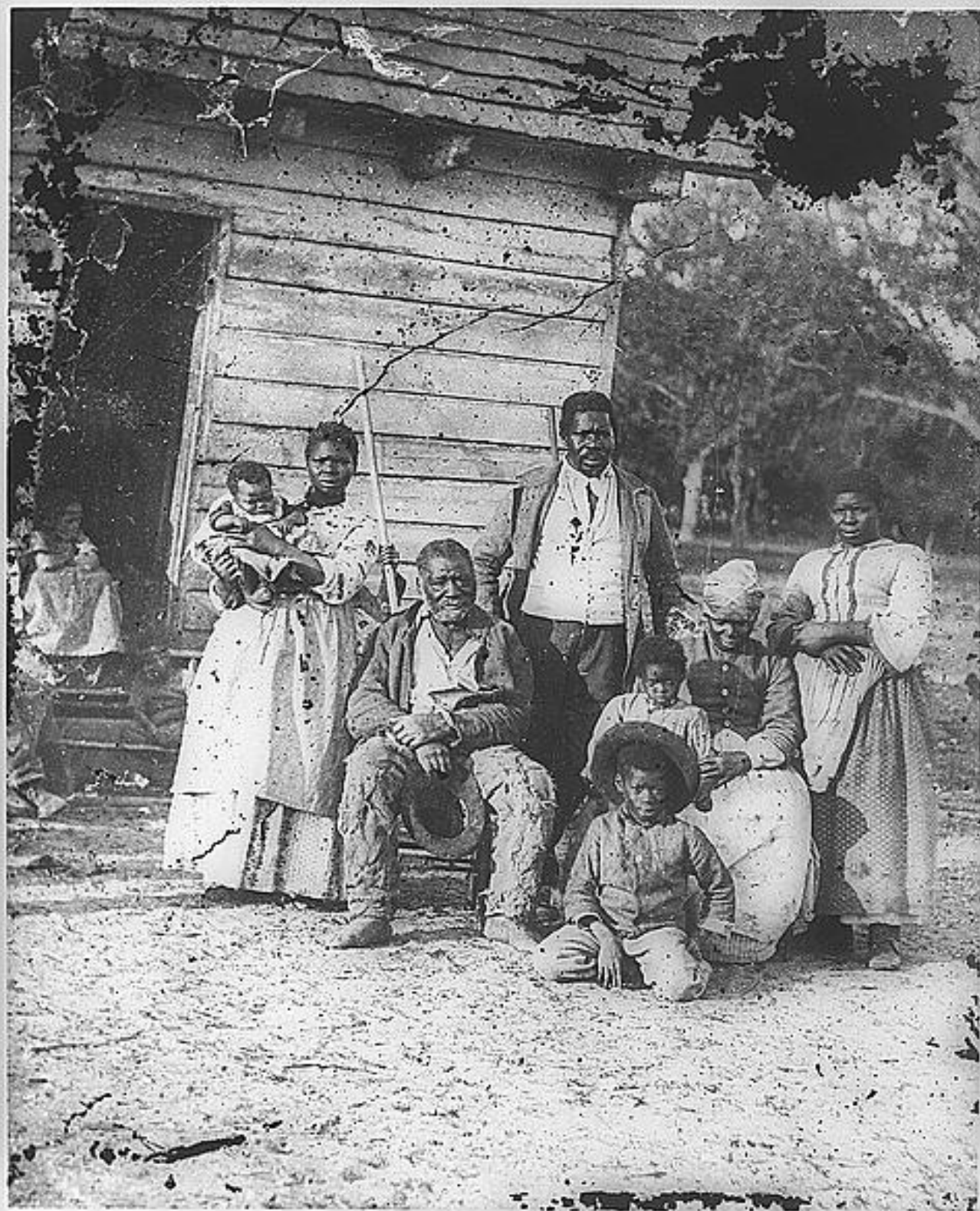
Group One Primary Source Set Primary Source #2 of 3