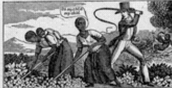
Mothers with young Children at work in the field.