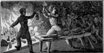
Cutting up a Slave in Kentucky.