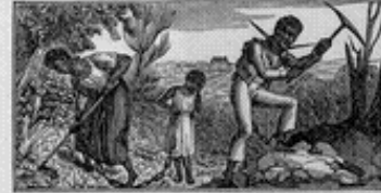
A Woman chained to a Girl, and a Man in irons at work in the field.