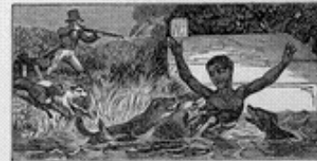
Hunting Slaves with dogs and guns. A Slave drowned by the dogs.