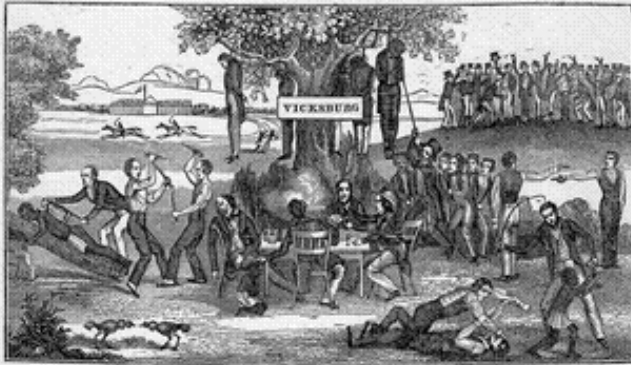
"Our Peculiar Domestic Institutions."