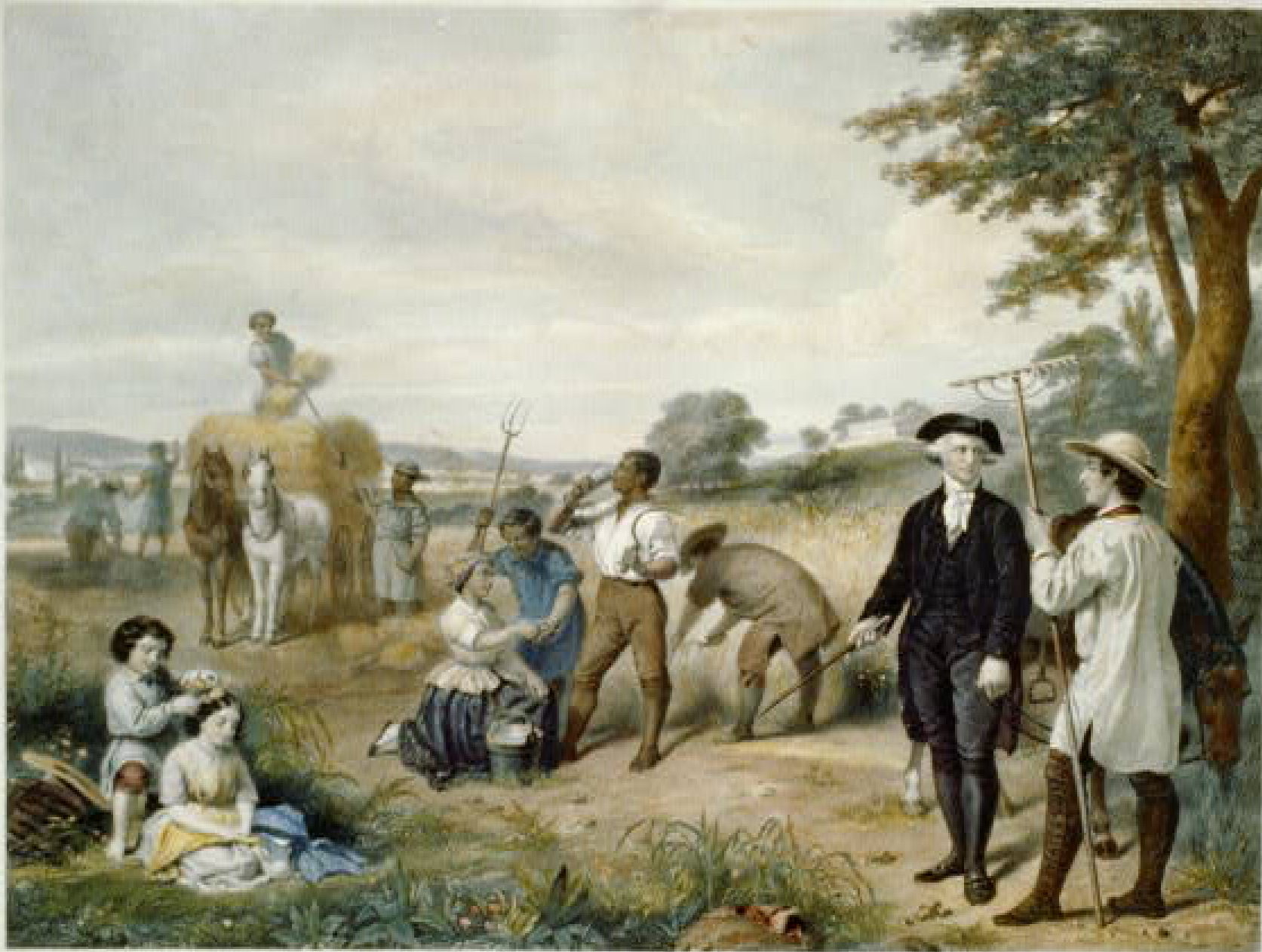
Group Two Primary Source Set Primary Source #3 of 3