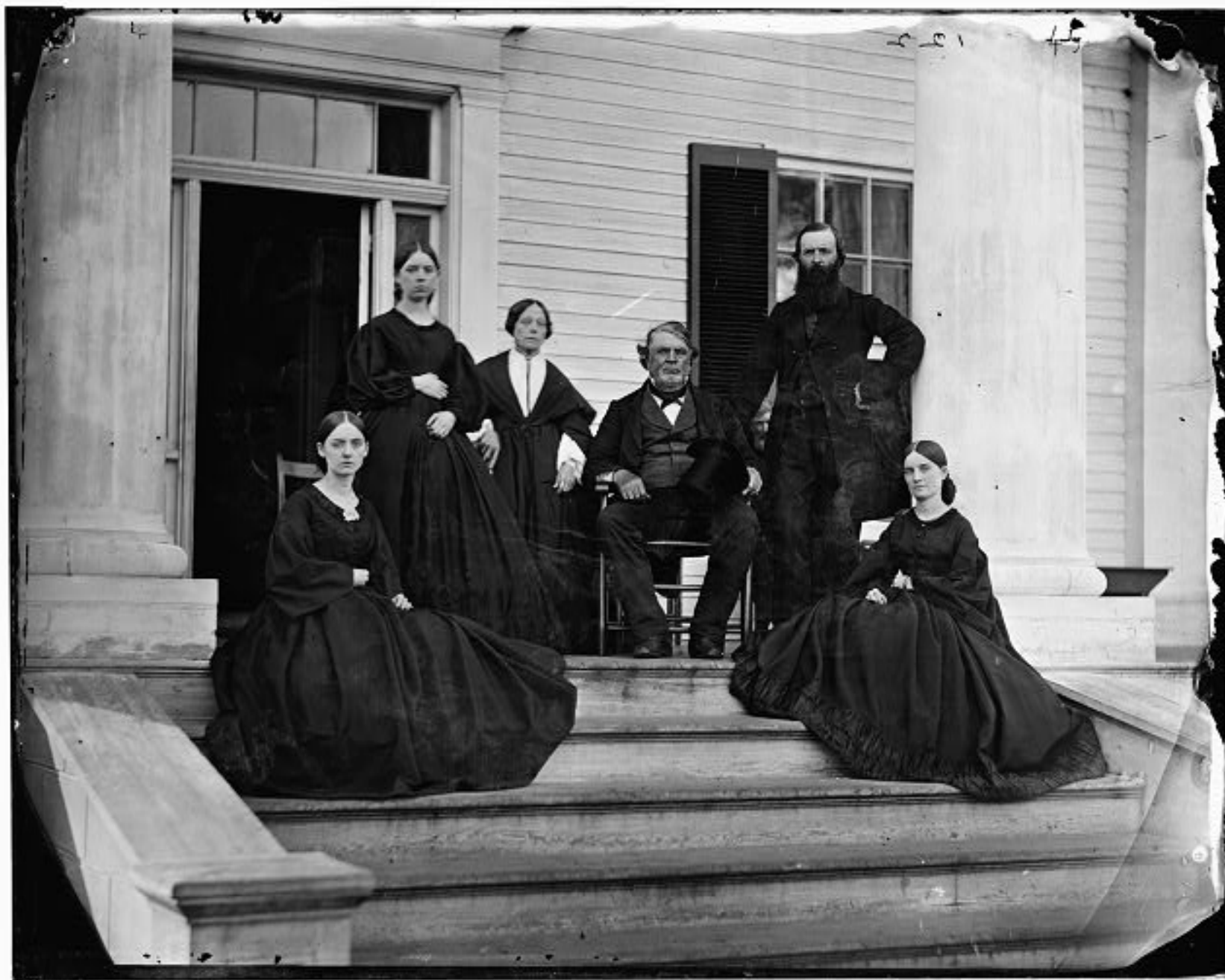
Group One Primary Source Set Primary Source #1 of 3