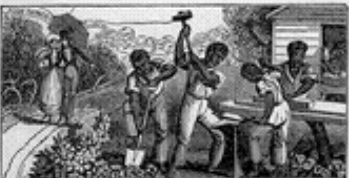
"Poor things, they can't take care of themselves."