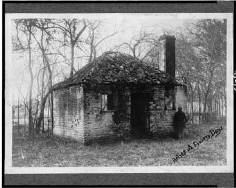
Relics of slavery days

Library of Congress Bibliographic record: http://hdl.loc.gov/loc.pnp/cph.3c03293