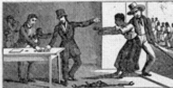
Selling a Mother from her Child.