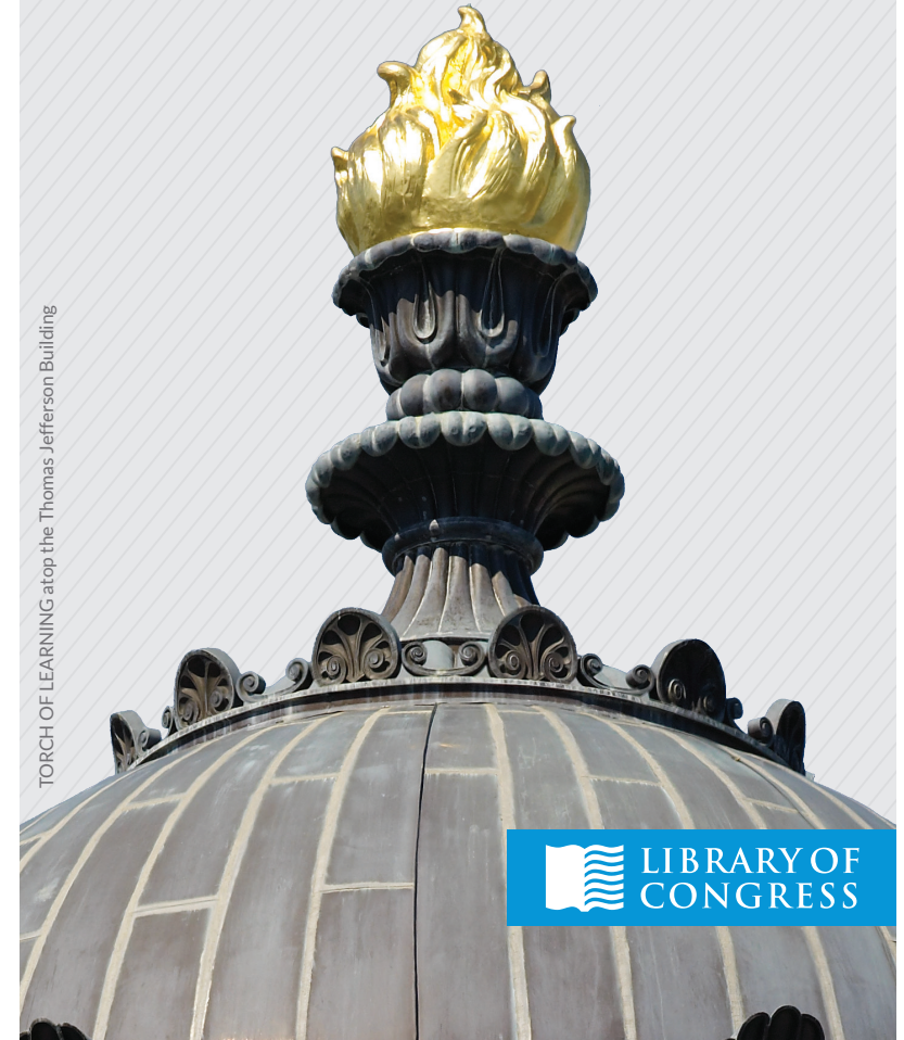
TORCH OF LEARNING atop the Thomas Jefferson Building