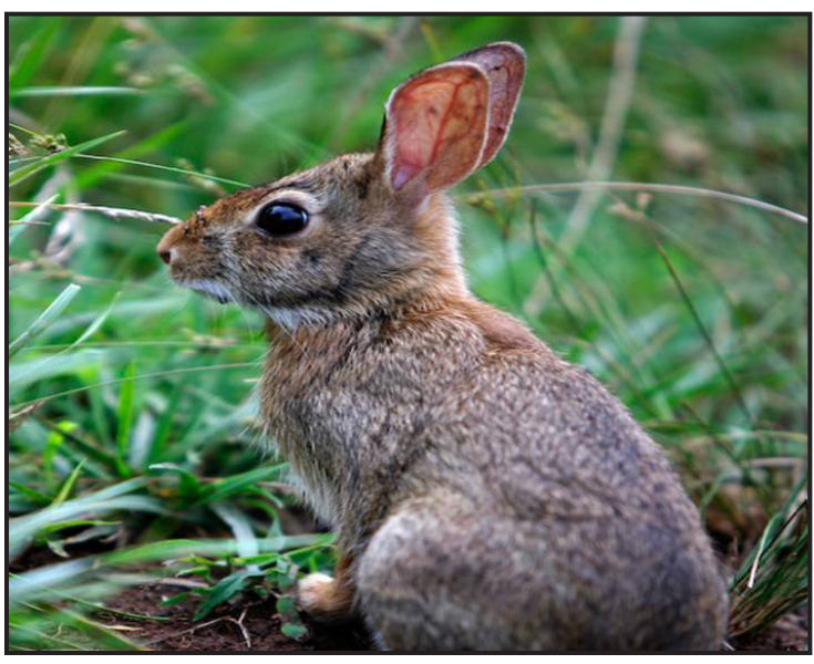
The Inventory and Monitoring Program is providing data to improve our understanding and management of park natural resources. Like this rabbit, our staff have big ears and listen closely to determine needs.

To facilitate collaboration, information sharing, and economies of scale in inventory and monitoring, the NPS has organized more than 300 parks with significant natural resources into 32 ecoregional networks to conduct inventory and monitoring activities.