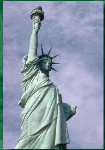
Statue of Liberty National Monument, New York & New Jersey