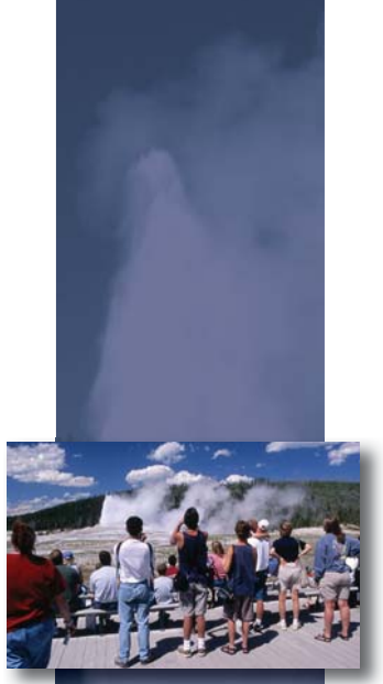
Yellowstone National Park, Wyoming