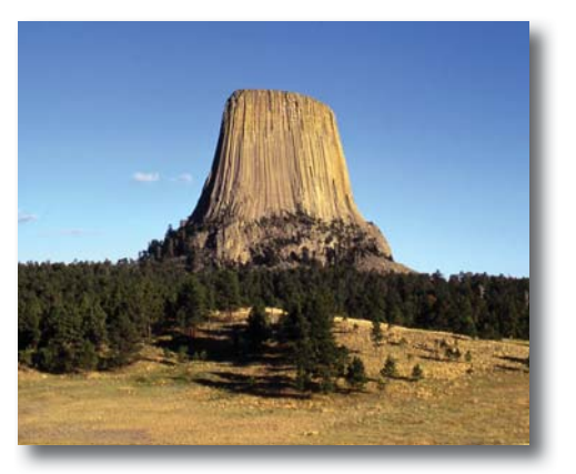
Devils Tower National Monument, Wyoming

National rivers and wild and scenic rivers preserve free-flowing streams that have not been dammed or otherwise altered and the ribbons of land that border them. Besides preserving rivers in their natural state, these areas provide opportunities for outdoor activities such as canoeing, rafting, and hiking.