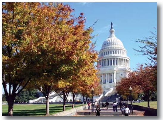
National Mall, Washington DC

We invite you to find out about the public lands near your home, including the National Park System.