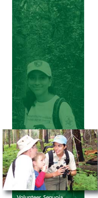
Volunteer, Sequoia National Park, California

Contact the National Park Service at (202) 208-6843 for further information on these opportunities.