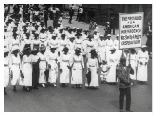
Silent protest parade http://hdl.loc.gov/loc.pnp/cph.3a34294

The National Association for the Advancement of Colored People, or NAACP, is America's oldest and largest civil rights organization. Founded in 1909, it was at the center of nearly every battle for the rights and dignity of African Americans in the twentieth century. Today, the NAACP honors its heritage of activism and continues to work for civil rights.