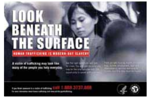
A search on the web for anti-slavery and anti-human trafficking web sites produces many promotional materials.

U.S. Department of Health and Human Services