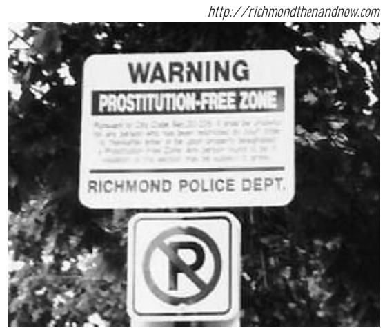
Making an area inhospitable for prostitution helps discourage the exploitation of trafficked women.

It can be argued that such a response will merely displace the activity. Although there has been no research on displacement of prostitution, research on the displacement of other crimes suggests that sometimes displacement occurs and sometimes it does not, depending on the particular crime and environment.<sup>63</sup> It has also been found that other crimes may decrease as a result of successful efforts to thwart a specific crime ("diffusion of benefits"). The following responses are adapted from the Problem-Oriented Guide on Street Prostitution . We strongly recommend that you consult that Guide for further information.