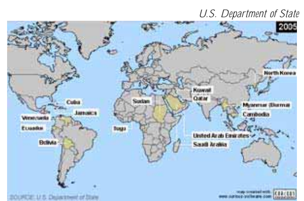
Some countries are deemed by the U.S. government as making no effort to comply with the Trafficking Victims Protection Act.

Supply. The international proliferation of trafficking has created a supply of trafficked women that is so large that it drives the market. Countries that make no attempt to control human trafficking<sup>§</sup> use the trade as a means of importing foreign currency, especially U.S. dollars and Euros. This is achieved both by encouraging sex tourism in the originating country and by tacitly approving the exportation of women to wealthy countries.<sup>31</sup> Globalization has facilitated the movement of cheap labor from one country to another. Thus, even those women who are not trafficked into the sex trade add to the plentiful supply of undocumented migrant labor at best, sweatshop and forced labor at worst.