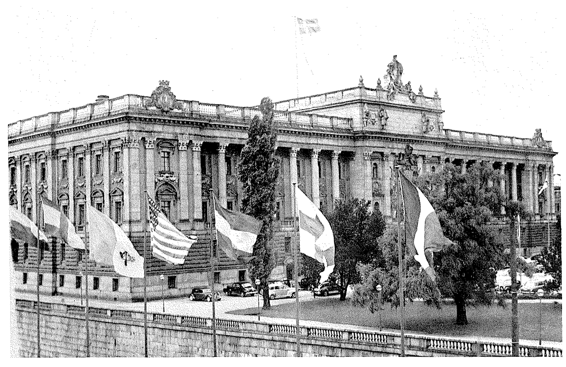
THE SWEDISH PARLIAMENT Seat of the Conference