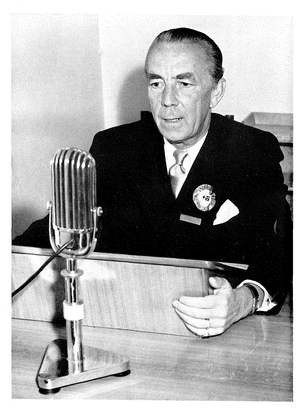
COUNT FOLKE BERNADOTTE President of the XVIIth International Red Cross Conference.