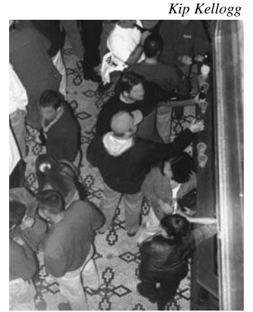
Occupancy limits should be enforced so that bar patrons do not feel crowded.

13. Maintaining an attractive, comfortable, entertaining atmosphere in bars. Attractive, well-maintained bars suggest to patrons that the owners care about their property and will not tolerate disorderly and violent conduct that might destroy it.69 A comfortable and entertaining atmosphere reduces both frustration and boredom among patrons, which can reduce aggression levels. Lighting should not be so bright that it acts as an irritant, but also not so dim that it can conceal customers' activities.70 An important environmental consideration is the crowding level. Police in some jurisdictions enforce occupancy limits (primarily adopted for fire safety) as a means to control the bar crowding that can lead to fights. Redesigning a bar's interior to improve traffic flow and prevent congestion can reduce the opportunities for accidental bumps and drink spills that may escalate into fights.71