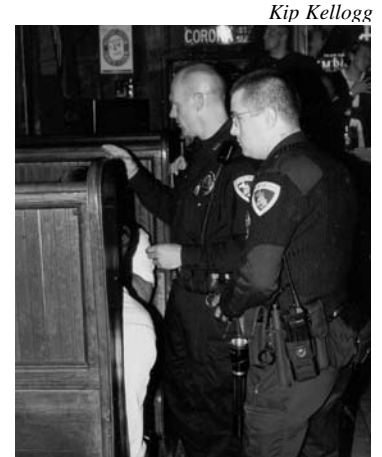
Police inspections of bars and enforcement of liquor laws encourages bar owners to adhere to responsible management practices.