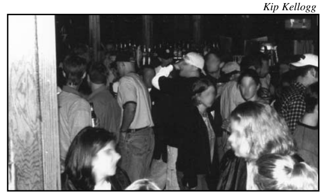
Crowding in bars creates the risk of accidental bumping and irritation, which can lead to assaults.

Poor ventilation, high noise levels, and lack of seating make bars uncomfortable. This discomfort increases the risks of aggression and violence.<sup>28</sup> Crowding around the bar, in restrooms, on dance floors, around pool tables, and near phones creates the risk of accidental bumping and irritation, which can also start fights.<sup>29</sup>