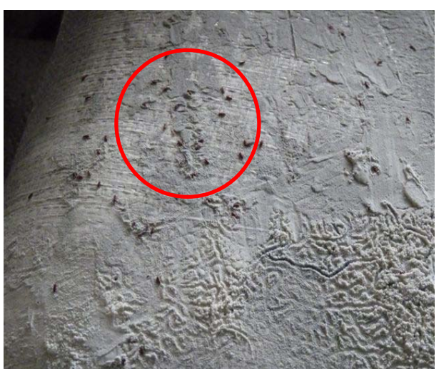
Damaged commodities, left, in the Durban warehouse are not marked for disposal or reuse. Buginfested commodities, right, are stored near undamaged ones.

Poor storage practices can damage commodities and increase costs. For example, even if damaged commodities are reused, the extra testing and handling could delay shipments and drive up costs for USAID. The system used by the Office of Acquisition and Assistance's Transportation Division does not include losses that occur in the warehouse. Although damage to commodities generally occurs during transport, loading, and unloading, warehouse contractors sometimes move commodities within the warehouse between shipments that can be damaged because of poor stacking. For example, we observed commodities that were stacked on broken pallets and others that had fallen or whose bags were ripped because of poor stacking. However, these losses could not be quantified because neither USAID nor the warehouse contractors tracked them. Although the warehouse contracts specify that these costs should be the responsibility of the warehouse contractor, USAID paid them during the audit period because the contractors did not report any losses.